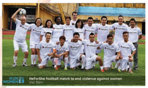
HeForShe football match to end violence against women

More videos are available here or visit our website here... >