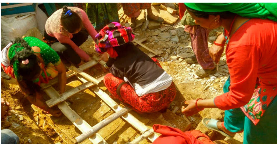
"Learning by Doing", female participants are learning the Build Back Safer 10 Key Messages. Gati, Sindhupalchok

The NRA's guidelines related to the Reconstruction Community Committee 2016 has a provision requiring at least 42% representation of women at the settlement level and at least 37% at the VDC/Municipality level. The NRA enforced the guidelines on Recovery and Reconstruction Training Conduction and Management, 2016 which prioritises youth, single women, persons living with disabilities, and representation of excluded and disadvantaged groups as training participants. The NRA's NGO mobilisation guidelines of 2016 include provisions for the role of NGOs in conducting capacity development programmes for the mainstreaming of disadvantaged groups.