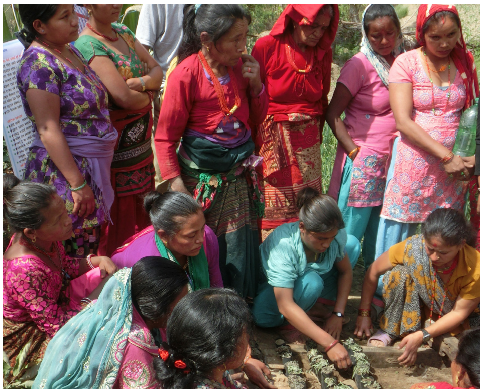
Livelihood training (Improvement of women household vegetation) in Irkhu in Sindhupalchok.

specifically related to protection themes (such as violence, tensions, discrimination and mistreatment etc), higher than average responses are observed by Dalit respondents. In Dolakha, 19% of respondents said there is a problem with violence in their community; which is nearly 4 times the national average. Respondents in Sindhupalchok and Gorkha also indicated higher than average levels of violence within their communities, at 11% and 9 % respectively. Only 19% of respondents overall reported having provided feedback to the Government on the recovery and reconstruction process, and 15 % to I/NGOs. It was found that women are much less likely than men to provide feedback. The main reasons cited by respondents include not feeling anyone will listen, not feeling like it will change anything and not knowing where or how to provide feedback. Key recommendations are: 1) protection partners should look into higher levels of perceived violence in communities in Dolakha, Sindhupalchok and Gorkha, and 2) all recovery and reconstruction partners should scale up their efforts to make feedback channels accessible to communities and to demonstrate to those communities that their voice is being heard and explain how their feedback impacts decisions.