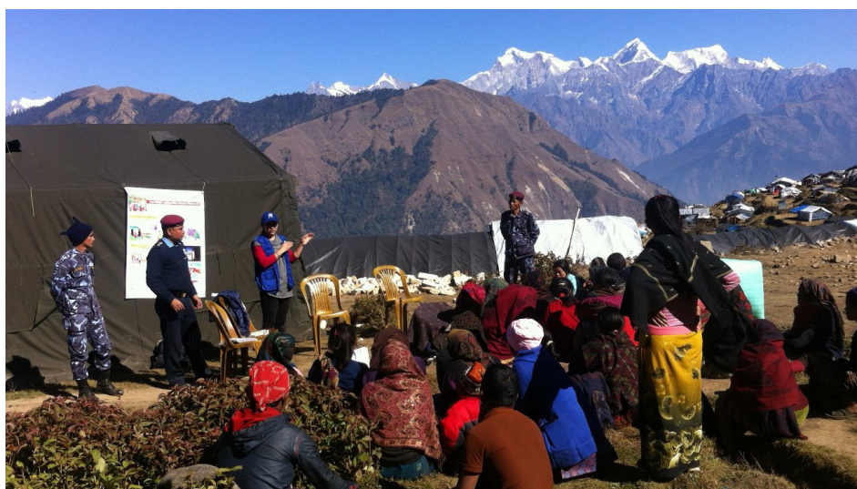
Awareness raising session on human trafficking, unsafe migration and GBV, at Gupsipakha campsite, Laprak.

UNDP is promoting cash for work as temporary employment through debris management, so far 4,350 people have received temporary employment through cash-for-work (40% of which are women). UNDP is providing training to engineers, masons, house-owners and Emergency Operation Centres (EOC) staff on damage assessment, safer construction practices and disaster risk management. So far 577 engineers (including 99 women) have been trained on damage assessment of earthquake affected households, 253 engineers (47 women), 673 masons (106 women) and 466 house-owners have been trained on safer construction practices. Through UNDP support, 314 members (92 women) of Community Based Disaster Risk Management Committees were trained on search and rescue, livelihood, early warning systems, disaster risk management mainstreaming and institutional development.