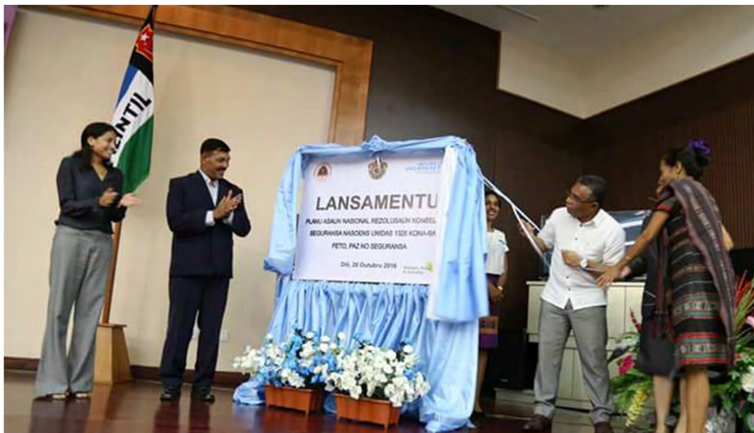
Prime Minister of Timor-Leste Rui Maria de Araújo at the official Launch of the NAP WPS.

On 20 October 2016, Timor-Leste officially launched its National Action Plan for the implementation of the United Nations Security Council Resolution 1325 (2000)/NAP UNSCR 1325, on Women Peace and Security.