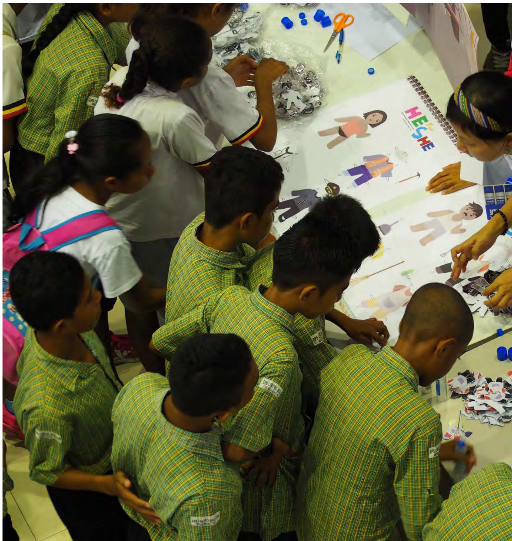
KOICA Volunteer facilitating an interactive activity with school children during the launch of HeForShe Campaign.