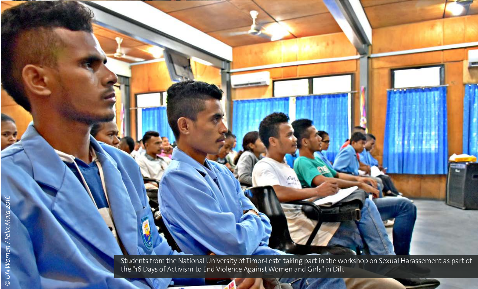
Students from the National University of Timor-Leste taking part in the workshop on Sexual Harassment as part of the "16 Days of Activism to End Violence Against Women and Girls" in Dili.