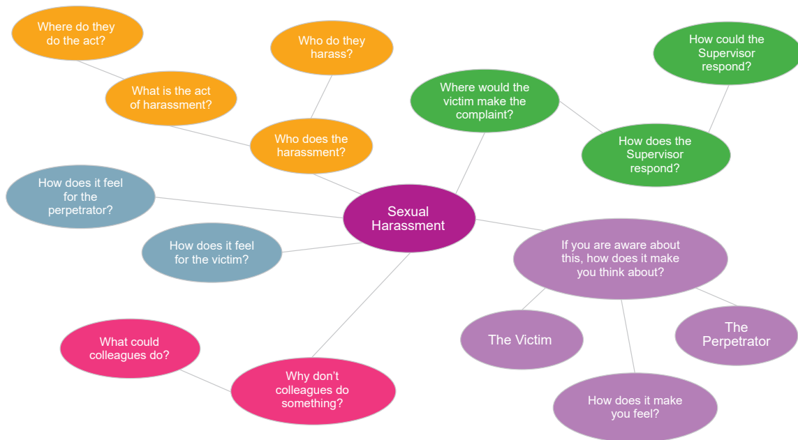
Sexual Harassment Mapping: Feeling, Thinking and Acting (adapted from EU project on sexual harassment in schools, TOT Kenya 2019)

Based on the information and concepts discussed during the day, the participants are expected to revisit their mapping, and see if they want to make changes to how they had previously analysed the organization's systems. They should