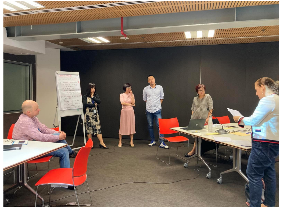
Photo: UN Comms Team mini retreat in 2020 to develop 2021 workplan