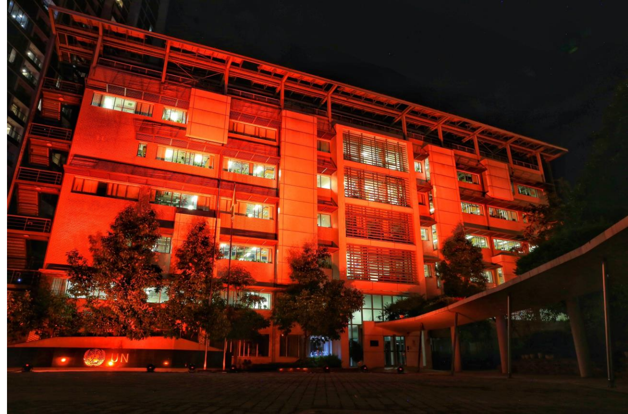
The One UN House was lighted-up orange during 16 Days Campaign in 2021