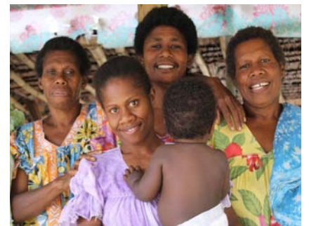
Vendors at the Epau Ring Road Market in Vanuatu.

The first markets I visited were ring road markets, which are very small and at first glance may not seem to be thriving economic hubs, but I learned that they have become major stopping and gathering points. The women vendors running them are highly organised and largely integrated into the local community structures.