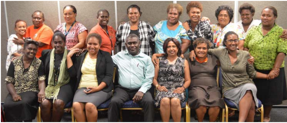
Civil society and government representatives who took part in the mock-CEDAW session in Honiara, Solomon Islands.

Women's rights in Solomon Islands were under the microscope in October at the 59th session of the Committee on the Elimination of Discrimination against Women in Geneva.