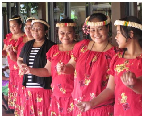
Representatives of Pohnpei at the Third Women's Conference in the Federated States of Micronesia.

UN Women's technical adviser for the Advancing Gender Justice in the Pacific programme attended the conference and gave a presentation on what UN Women is doing in other countries as well as what could be