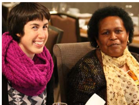
Participants in UN Women's Pacific Fund Knowledge and Learning Exchange in Melbourne.