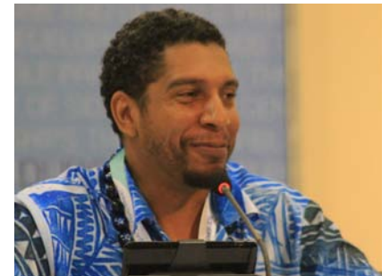
Camillo Gonsalves Minister of Foreign Affairs, Foreign Trade, Consumer Affairs and Information Technology, St Vincent and the Grenadines taking part in UN Women's Beijing +20 side event.