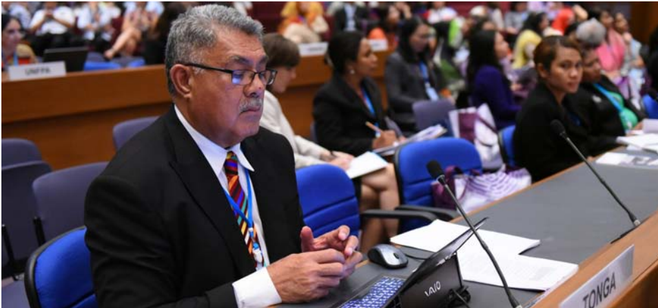
Lopeti Senituli, CEO of the Ministry of Internal Affairs in Tonga, represented Tonga in negotiations over the wording of the official declaration ahead of the ministerial meeting.

Representatives of governments and civil society organisations from across the Asia-Pacific region gathered in Bangkok in November to review progress and gaps in their implementation of the Beijing Platform for Action ahead of next year's 20th anniversary.