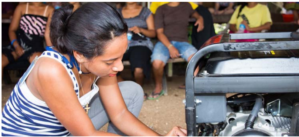
A young woman learns to use a generator in Pohnpei in the Federated States of Micronesia in this winning entrant for UN Women's photo competition. The photo won first prize in the professional category and was among 20 Pacific images displayed at the SIDS conference in Samoa.

It's hard to believe it's already the end of 2014; it's been a very busy year for UN Women in the Pacific. We have taken part in, supported and initiated a number of significant activities and events across the region, helping to raise the awareness of, and take steps towards achieving, gender equality and women's empowerment.