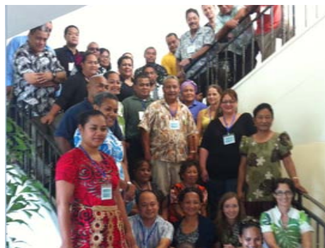
Participants at UNICEF's workshop on Child Protection in Emergencies held in Palau.