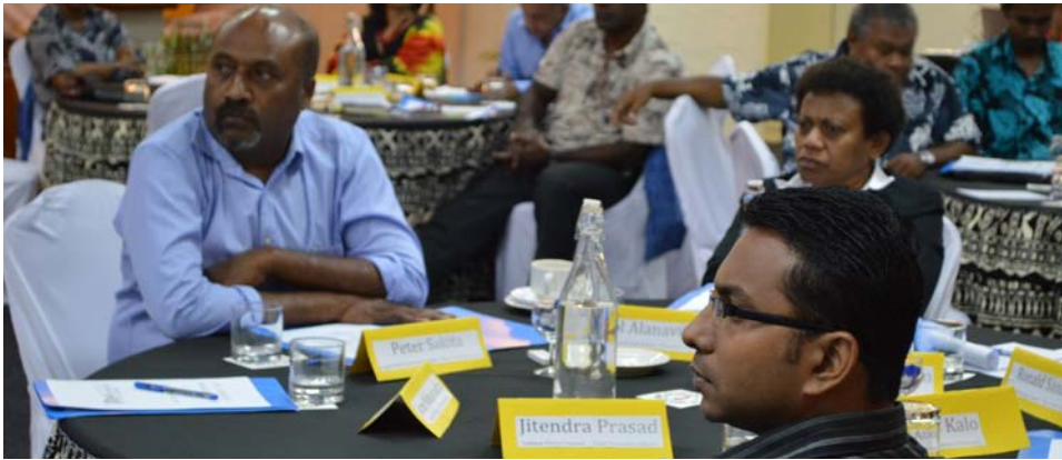
Participants at the Stakeholders Roundtable event for UN Women's Markets for Change project in Nadi.

Municipal councils across the region met at the Markets for Change stakeholders roundtable event in November and found that although their markets and towns are quite different, they share a lot of the same challenges and some have discovered different ways of dealing with them.