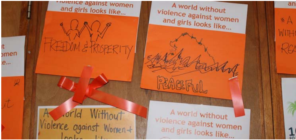
Participants in Solomon Islands 16 Days of Activism events expressed what a world without violence against women and girls would look like.

Cities and towns across the Pacific were awash with orange over the past month as people heeded the call to “Orange your Neighbourhood” during the 16 Days of Activism against Gender Violence campaign.