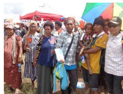
Participants at an event hosted by Pacific Fund grantee Eastern Highlands Family Voice in Papua New Guinea.

The Pacific Fund is a key component of UN Women's Ending Violence against Women and Girls programme and was established in 2009 to support innovative projects working to prevent violence and provide services to survivors.