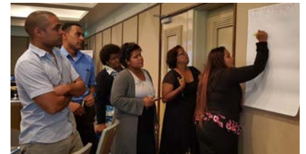
Participants at the assessor training.

The assessment comprised 25 assessors from Government, local and international NGOs, civil society organisations, and UN agencies in 35 locations in urban, rural and remote hard to reach affected areas. They talked to women and men community leaders and representatives, and conducted focus group discussions across the country to solicit information and experiences from women and girls, boys and men including older persons, persons with disabilities and members of the LGBTI community.