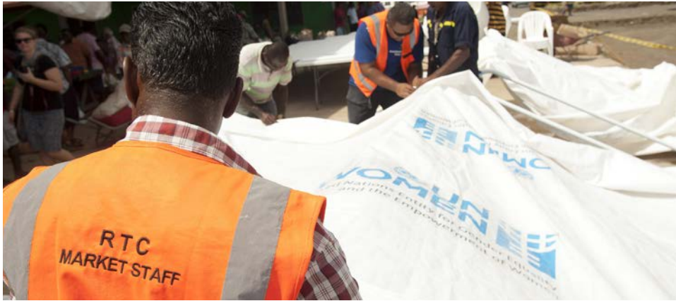
Rakiraki Town Council staff help put up the tents provided by UN Women to serve as a temporary market space.

The Rakiraki Market used to house more than 200 vendors, 76% of whom were women. The only shelter left standing has room for a quarter of that number and many of the tables and chairs that were kept in the market have been damaged or destroyed.