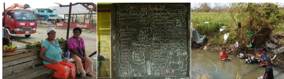
TC WINSTON (L-R): Market vendors selling bananas under the bus shelter in Rakiraki just days after the cyclone with the ruined market in the background. Credit: UN Women/Vilisi Veibataki; the roll call for eight families living in the Korotale Narara Kindergarten in Buka Settlement, just outside of Rakiraki. Credit: UN Women/Murray Lloyd; lack of running water in the immediate aftermath meant women were washing clothes and bathing in creeks like this. Credit: UN Women/Preeya Ieli.

As we look towards this month’s World Humanitarian Summit in Turkey, the lessons learned from Winston will further help to reshape humanitarian action to make it more people-focused and inclusive — and fundamentally more effective.