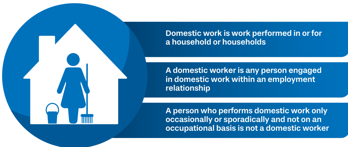
Figure 1: ILO Convention 189 definition of domestic work

Domestic work is generally classed as low-skilled. Non-caring domestic tasks that are sometimes recognized as being specialized, like gardening and