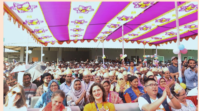
Many people gathered to launch the 16 Days of Activism in Cox's Bazar.