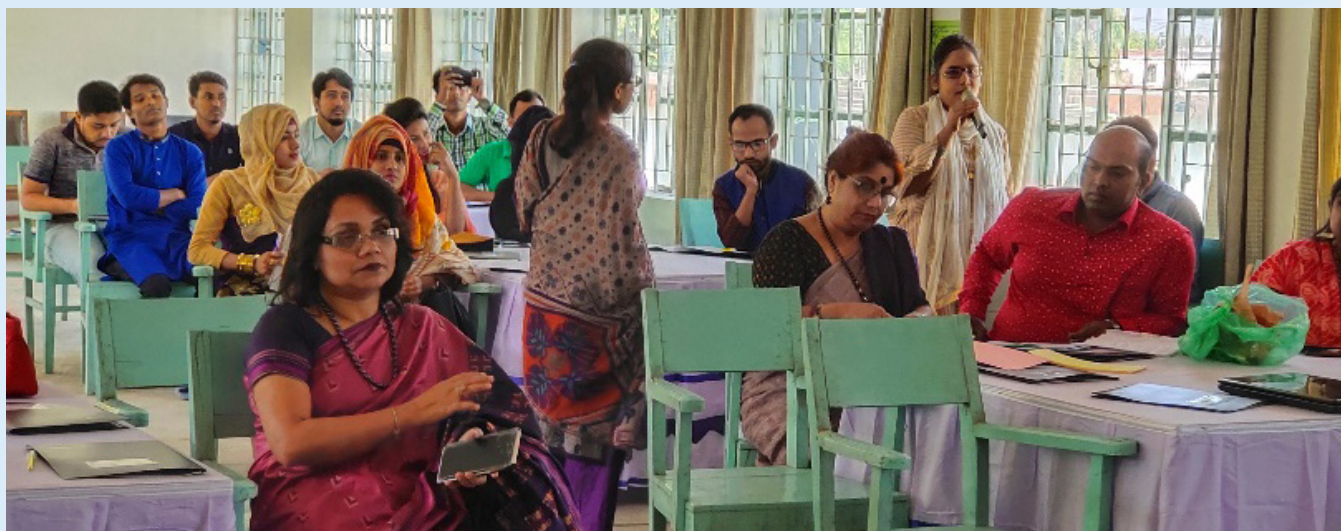
Participants actively engage in the training session at Victoria College.

With support from Naripokkho and Protttoy, students and staff at Victoria College undertook training on sexual harassment and the High Court Directive.