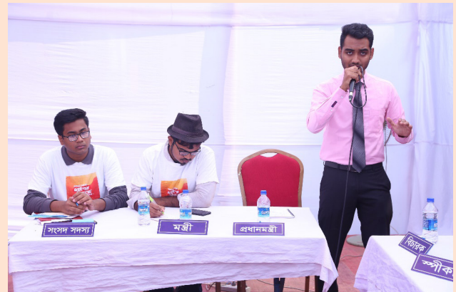
Students engage in a lively debate.