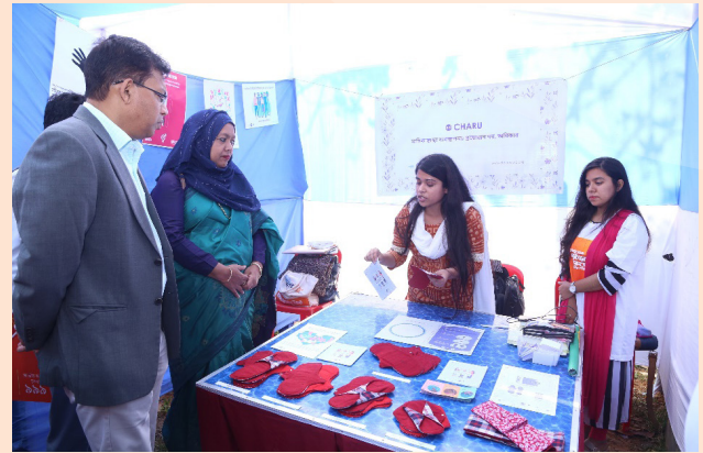
The winners of the Innovators Against Gender Based Violence Competition launch their product.