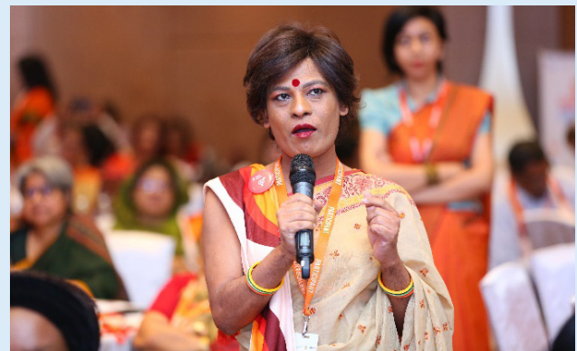
Participants were invited to share their experiences with the panel and ask questions.