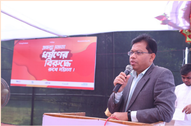
The Vice-Chancellor of Comilla University addresses the students.

UN Women and its partners Naripokkho and Prottoy hosted a day-long event at the University of Comilla. The day was packed with interactive activities such as signing pledges for the Clothesline Project on campus, student debates, film screenings, theatre performances and youth-led entrepreneurship's. The winners of UN Women's Innovators Against Gender Based Violence Competition also presented on their journey and hosted a stall to launch their product. The Fair Day worked to engage with youth through edutainment to raise issues around the root causes of sexual violence, gender biases and stereotypes, and jointly discuss possible solutions moving forward.