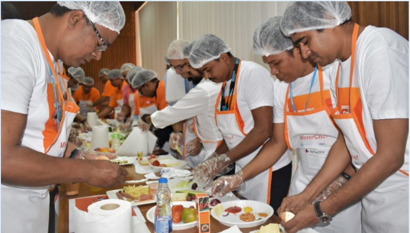
Teams race against the clock to assemble their dishes.