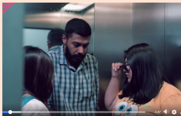
“Gender flip” video featured on Daekho Facebook page has been shared more than 3,000 times and viewed more than 383,000 times.

A viral video posted on the popular Facebook page ‘Daekho’ reveals a parallel world where gender roles are reversed. It follows the experiences of men being harassed in public and private spaces, including an elevator, on public transport, the workplace, at home, and online. The video targeted Bangladeshi youth, and has already been shared more than 3,000 times and has been viewed over 383,000 times. You can watch it here: https://www.facebook.com/DaekhoTV/videos/535760783673300/ .