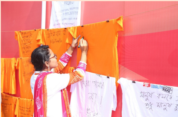
A student writes her pledge in support of the Clotheslines Project.