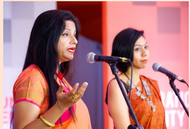
Performers tackle the issue of harassment at work in a performance piece entitled “Bitch Goddess”.