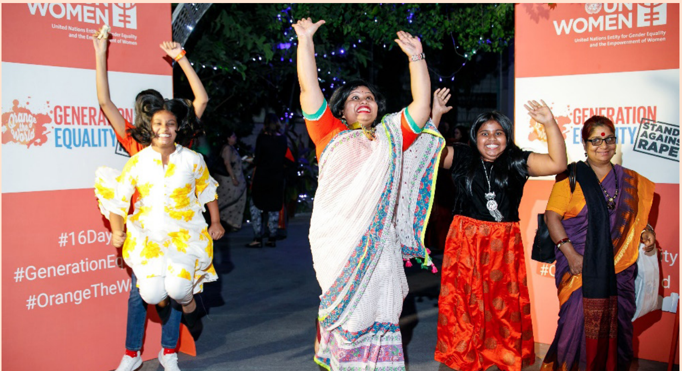
Participants network and enjoy the evening of performances.