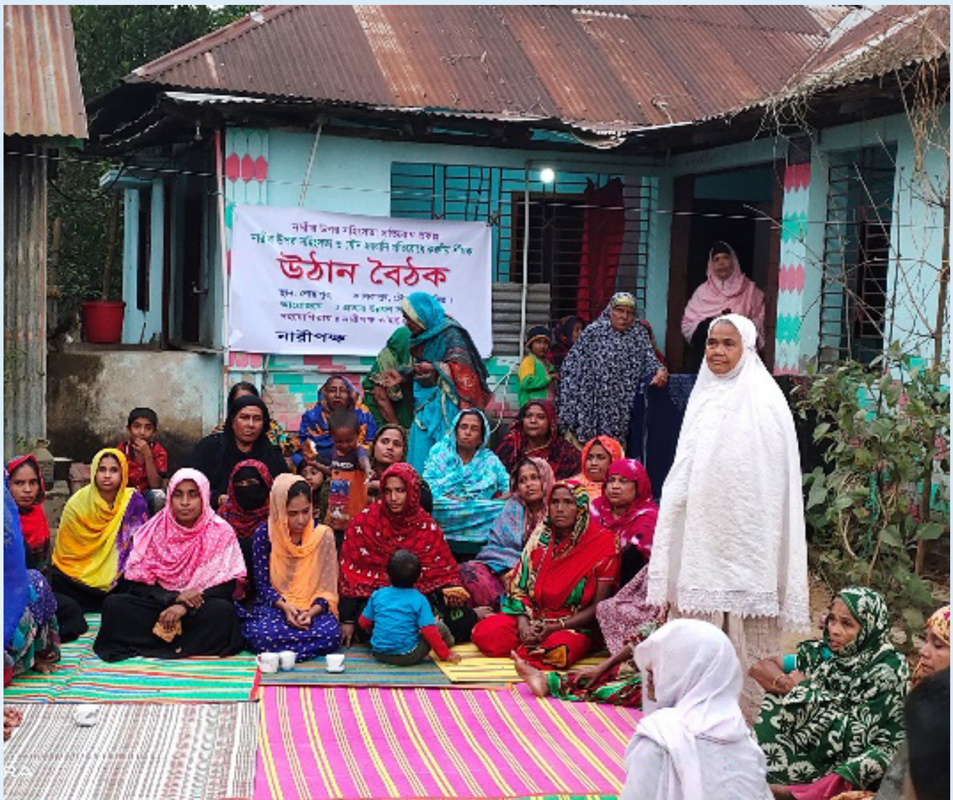
Community members gather in the courtyard to discuss the issue of sexual harassment and gender-based violence.