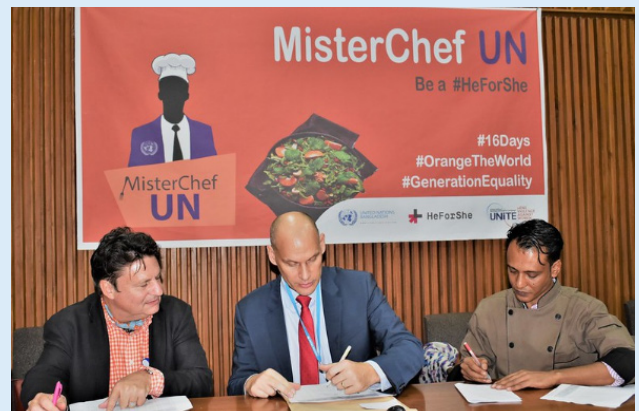
The judges deliberating the winning UN agency.