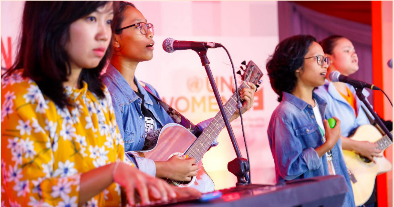
F-Minor, the first female Indigenous band in Bangladesh, serenades the crowd.