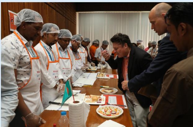
Judges and supporters taste the food prepared by the Mister Chefs.