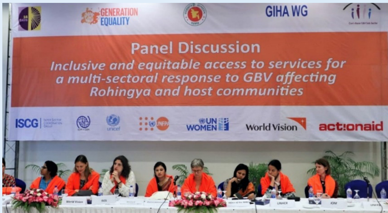
Panelists of the consultation.

Panelists and participants discussed challenges and practical solutions in accessing services for justice, health, safety/security and self-reliance for the Bangladeshi host community and the Rohingya refugees, under the umbrella theme “Inclusive and Equitable Access to Services for a Multi-Sectoral Response to GBV affecting Rohingya and Host Communities”.