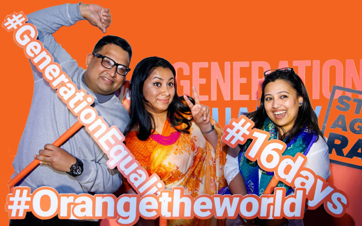
Participants at the Performing Arts and Adda event held on 8 th December 2019.