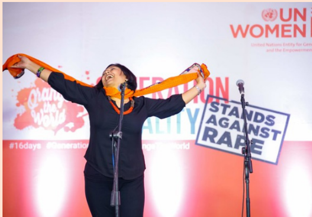
A humorous and lively performance unpacks the connotations associated with the “orna”.

Over 100 of UN Women partners —CSOs, donors, media and activists—gathered on the ‘orange’ front lawn of UN Women Bangladesh to explore the themes of violence, stereotypes and harassment through drama, performance, and music. The crowd revelled in experimental tribal music by F-Minor, the first female Indigenous band in Bangladesh, as well as enjoying provocative performances from Bonhishikha, a voluntary group working to end gender-based violence. Performance monologues raised issues around consent, workplace harassment, and the societal connotations of the “orna” that many women are still, to this day, forced to wear.