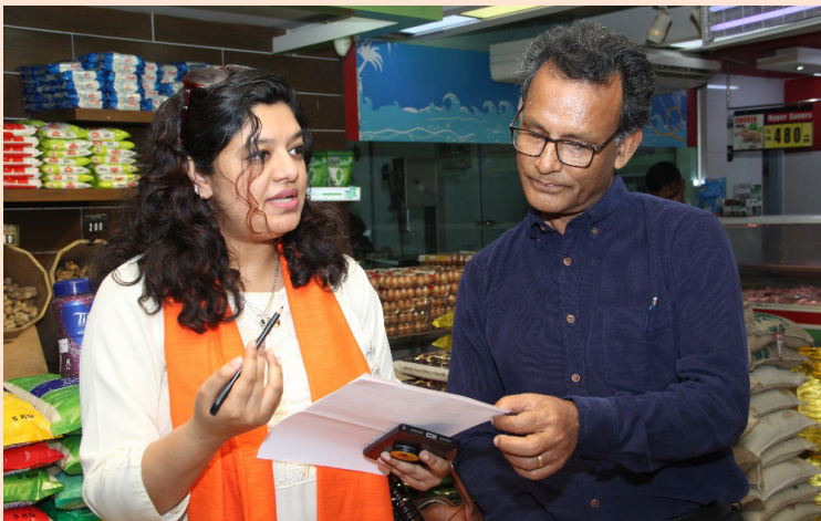
Participants network and enjoy the evening of performances.

Over the 16 days, a quiz competition was held at five branches of Shwapno Supershop. The quiz explored the root causes of rape, and reached approximately 1000 shoppers across all outlets.