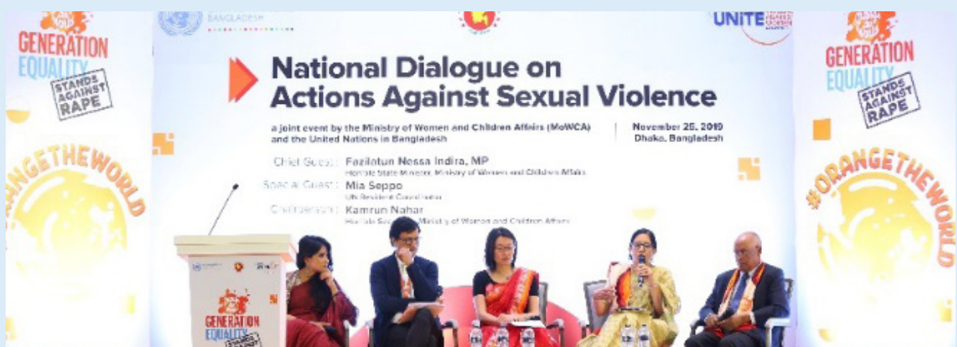
Panel members ranging from legal experts, government officials, academics and heads of UN agencies discuss the theoretical framework of gender-based violence.