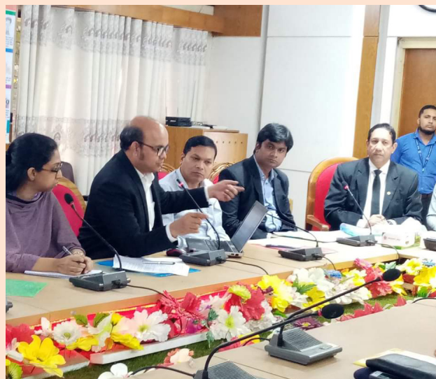
Experts discuss implementation of the High Court Directive during a community consultation.

Experts from legal, health, social welfare and NGO sectors developed a number of recommendations, highlighting the need for awareness-raising and advocacy of the HCD, training for essential services, establishment of more support centers, and the strengthening of justice systems and laws.