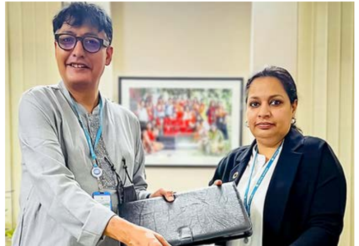
UN Women and ILO deepen cooperation to advance women's economic empowerment in Bangladesh