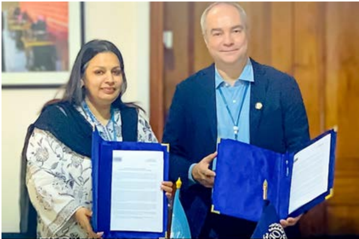
UN Women and ILO deepen cooperation to advance women's economic empowerment in Bangladesh

UN Women Bangladesh has signed inter-agency letters of collaboration with UNDP and ILO for the period of 2022-2026 to advance gender equality and women's empowerment in Bangladesh. UN Women and UNDP will be working together to advance gender responsive policies, plans and financing and address discriminatory social norms. ILO and UN Women Bangladesh will work together with the government to address women's unpaid care work and gender-based violence at the workplace, increase women's economic leadership, social protection and generate gender statistics for policy reforms.