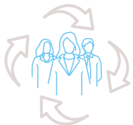
Support referrals to local district courts

UN Women partnered with the Partnership of Philippine Support Service Agencies (PHILSSA) to deliver a series of paralegal trainings for 123 civil society organizations and 765 community leaders to equip them with skills and knowledge to facilitate the documentation and referral of cases.