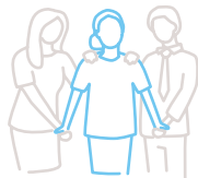
Support reintegration and rehabilitation

Legal clinics were established in all nine communities , which were supported by paralegal volunteers. The legal clinics provide the necessary space for paralegals to discuss complex cases with facilitators or receive technical assistance on justice procedures.