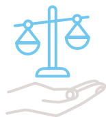
Legal assistance to women in conflict with the law