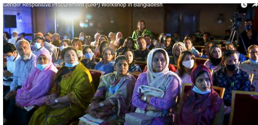
Gender Responsive Procurement (GRP) Workshop in Bangladesh

The UN in Bangladesh organized a half-day long Gender-Responsive Procurement Workshop on 18th August 2022 to increase the participation of women-owned and women-led businesses and entrepreneurs in the UN supply chain. It is the first step towards reducing the gender gap in UN supply chains. Around one-hundred-fifty representatives from various women-owned organizations and businesses across the country attended the workshop to learn about gender-responsive procurement processes, the United Nations Global Market, and associated business opportunities. Watch the video here .