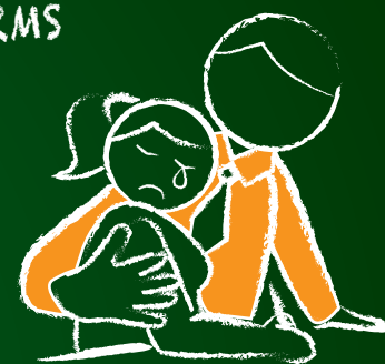
SEXUAL VIOLENCE AND HARASSMENT

In Asia-Pacific, girls are more likely to face social exclusion, sexual and psychological violence while boys are more likely to experience corporal punishment, bullying and other forms of physical violence. Violence experienced by transgender students is poorly discussed and documented