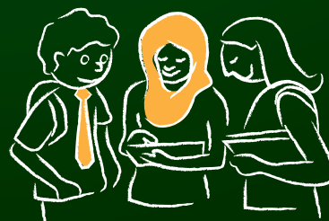
ENGAGE YOUTH IN CREATING SOLUTIONS