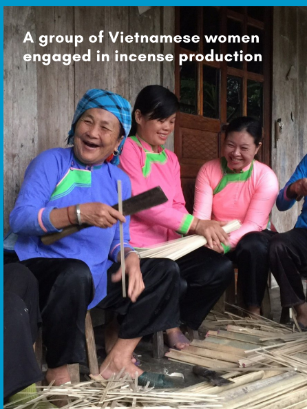
A group of Vietnamese women engaged in incense production

Finally, UN Women and the NAP Global Network also co-organized a peer-to-peer learning event to identify the entry points and the enabling factors for gender-responsive climate actions within the framework of a National Adaptation Plan (NAP), bringing together government representatives from Bangladesh, Cambodia, and Viet Nam.