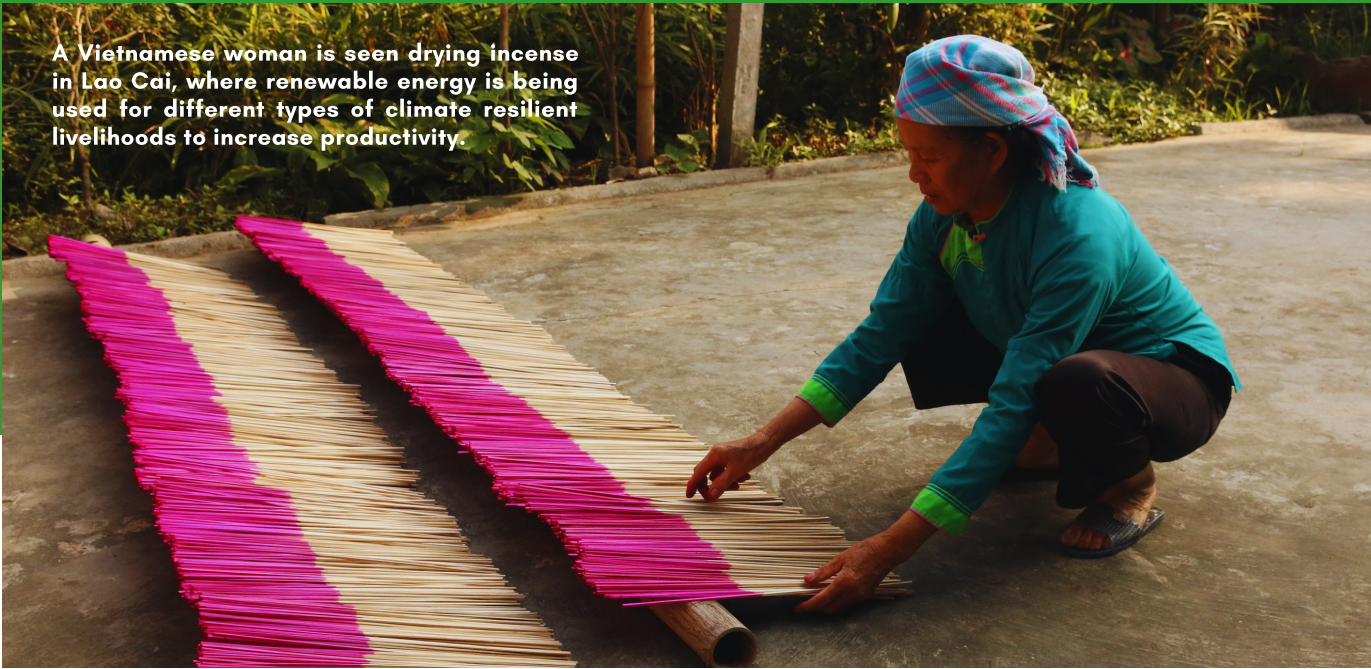
A Vietnamese woman is seen drying incense in Lao Cai, where renewable energy is being used for different types of climate resilient livelihoods to increase productivity.