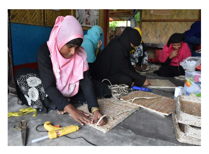
Rohingya refugee women making jute baskets, mats, vases, and trays at MPWC- Camp 4Ext.

With support of UN Women, livelihood activities take place in the MPWCs located in Camp 4, 4 Extension and 18 operated by ActionAid Bangladesh. In accordance with national and international standards, the MPWCs provide holistic, multisectoral services and support for women and girls in the camps, many of whom are survivors of gender-based violence (GBV). These include psychosocial counseling, GBV case management, and livelihoods and learning activities, among others, to address both the protection and empowerment needs of women and girls.