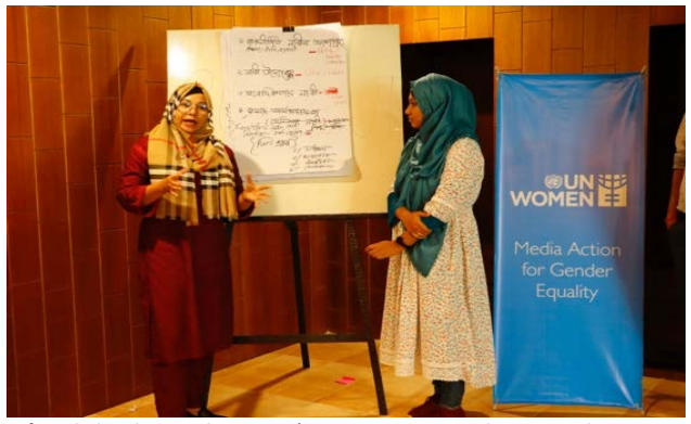
A female local journalist in Cox's Bazar presenting during gender-responsive journalism training.

Through the training, the participants learned skills in nongender-biased language, how to draft positive narratives on gender equality issues, interactive discussions on the importance of gender representation in media, how to address sensitivity when interviewing survivors of GBV, and ethical standards in reporting.