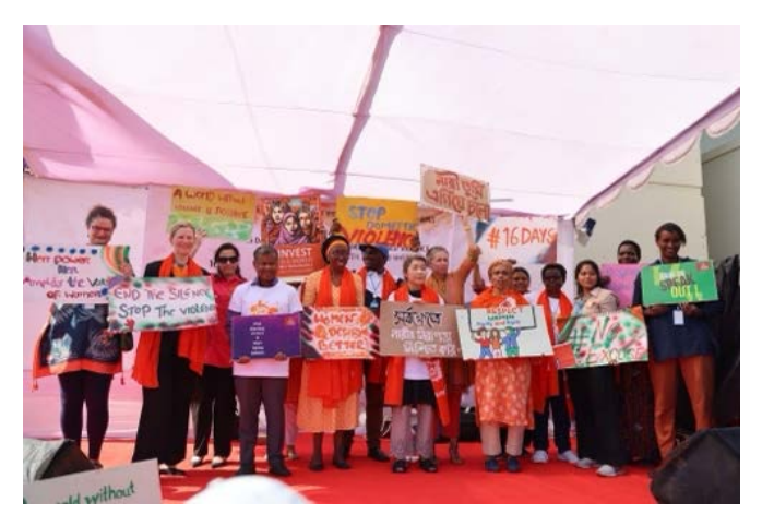
16 Days of Activism against Gender-based Violence commemoration in Cox's Bazar, Bangladesh.

The campaign kicked off with a colourful launch event at the Cox's Bazar Cultural Center and continued at the Rohingya Refugee Response Camps. The largest gathering of gender equality actors and women-led organizations in 2023, an Open Dialogue on "Advancing Gender-responsive Camp Governance," organized under the overall banner of the 16 Days of Activism against GBV campaign, brought all together more then 500 people including government, UN, and civil society actors.