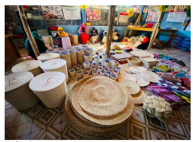
Eco-friendly jute baskets, mats, vases, trays, and others made by Rohingya women and girls in MPWC- Camp 4.

With support of UN Women, livelihood activities take place in the MPWCs located in Camp 4, 4 Extension and 18 operated by ActionAid Bangladesh. In accordance with national and international standards, the MPWCs provide holistic, multisectoral services and support for women and girls in the camps, many of whom are survivors of gender-based violence (GBV). These include psychosocial counseling, GBV case management, and livelihoods and learning activities, among others, to address both the protection and empowerment needs of women and girls.