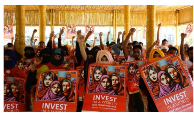
Participants raised their fists after a dialogue between Rohingya men and women with the 1W Camp-in-Charge during the Elimination of Violence against Women event at the camp.

Campaign events in the camps began on 26 November 2023, with the International Day for the Elimination of Violence against Women at Camp 1 West. Here, survivor stories made the call for community-driven approaches to GBV prevention, emphasizing the need for greater outreach and dedicated resources.