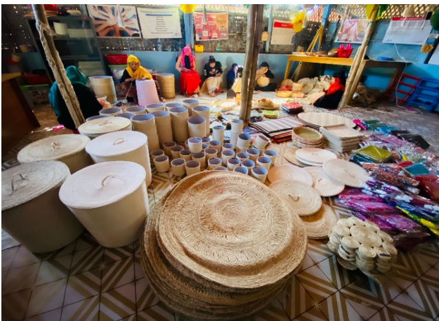
Eco-friendly jute baskets, mats, vases, trays, and others made by Rohingya women and girls in MPWC- Camp 4.

With support of UN Women, livelihood activities take place in the MPWCs located in Camp 4, 4 Extension and 18 operated by ActionAid Bangladesh. In accordance with national and international standards, the MPWCs provide holistic, multi-sectoral services and support for women and girls in the camps, many of whom are survivors of gender-based violence (GBV). These include psychosocial counseling, GBV case management, and livelihoods and learning activities, among others, to address both the protection and empowerment needs of women and girls.