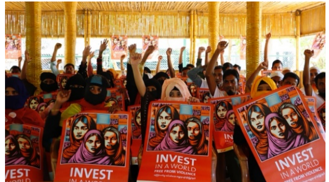
Participants raised their fists after a dialogue between Rohingya men and women with the 1W Camp-in-Charge during the Elimination of Violence against Women event at the camp.

The campaign kicked off with a colourful launch event at the Cox's Bazar Cultural Center and continued at the Rohingya Refugee Response Camps. The largest gathering of gender equality actors and women-led organizations in 2023, an Open Dialogue on "Advancing Gender-responsive Camp Governance," organized under the overall banner of the 16 Days of Activism against GBV campaign, brought all together more than 500 people including government, UN, and civil society actors.