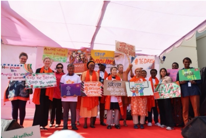
16 Days of Activism against Gender-based Violence commemoration in Cox's Bazar, Bangladesh.

The campaign kicked off with a colourful launch event at the Cox's Bazar Cultural Center and continued at the Rohingya Refugee Response Camps. The largest gathering of gender equality actors and women-led organizations in 2023, an Open Dialogue on "Advancing Gender-responsive Camp Governance," organized under the overall banner of the 16 Days of Activism against GBV campaign, brought all together more than 500 people including government, UN, and civil society actors.