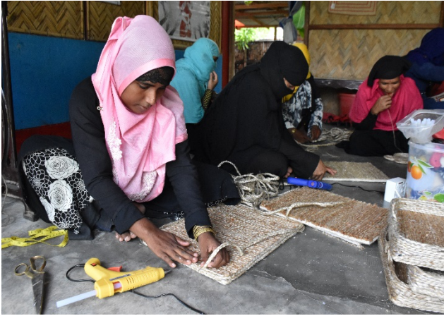
Rohingya refugee women making jute baskets, mats, vases, and trays at MPWC- Camp 4Ext.

With support of UN Women, livelihood activities take place in the MPWCs located in Camp 4, 4 Extension and 18 operated by ActionAid Bangladesh. In accordance with national and international standards, the MPWCs provide holistic, multi-sectoral services and support for women and girls in the camps, many of whom are survivors of gender-based violence (GBV). These include psychosocial counseling, GBV case management, and livelihoods and learning activities, among others, to address both the protection and empowerment needs of women and girls.