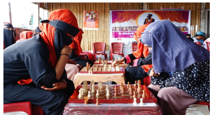
UN Women organized chess competitions during the 16 Days of Activism in Camp 1E between female gender volunteers.

UN Women introduced chess as a tool to empower Rohingya girls and challenge gender stereotypes in Cox's Bazar refugee camps. Traditionally seen as a male-dominated game, chess is now providing a platform for girls apply their critical thinking skills and participate in such recreational activities on an equal foot with boys. During the chess tournament held as part of the 16 Days of Activism campaign, Rohingya girls, wearing scarves with the message, "Empowered women empower generations," competed alongside boys.