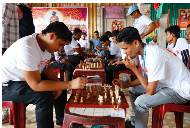
UN Women organized a chess competition during the 16 days of Activism against GBV in Camp 1E between male gender volunteers.

Mr. Aziz emphasizes, “Our society's imbalance stems from a narrow view of gender roles. Engaging men in this dialogue is not just about awareness, it is about action. We are here to redefine what it means to be allies in the fight against GBV and to promote equality.”