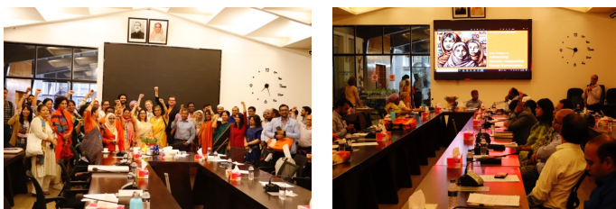
The Open Dialogue on "Advancing Gender-responsive Camp Governance" during 16 Days of Activism against GBV.

UN Women's Programme in Cox's Bazar is supported by: