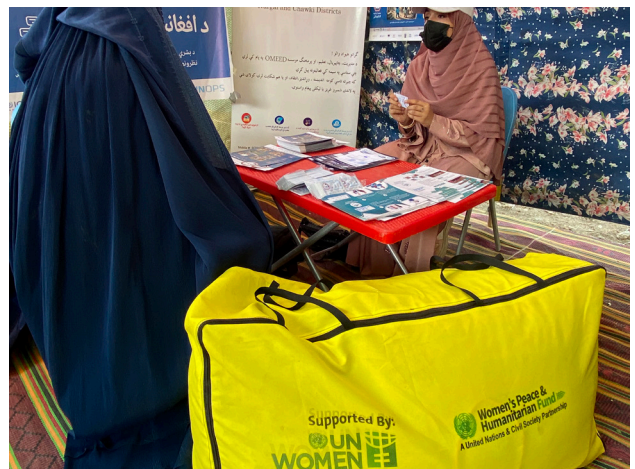
Photos above: With the support of UN Women, women humanitarianists distribute dignity and winterization kits to women affected by the earthquake in Kunar province, eastern Afghanistan.