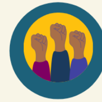
LEADERSHIP AND PARTICIPATION