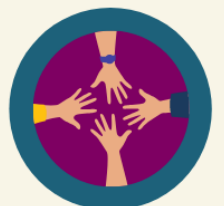
PARTNERSHIP AND ACCOUNTABILITY