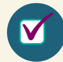
ACCURATE AND RELIABLE INFORMATION