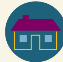
ACCESSIBLE AND SAFE LOCATION