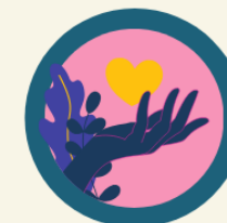
DIGNITY AND RESPECT