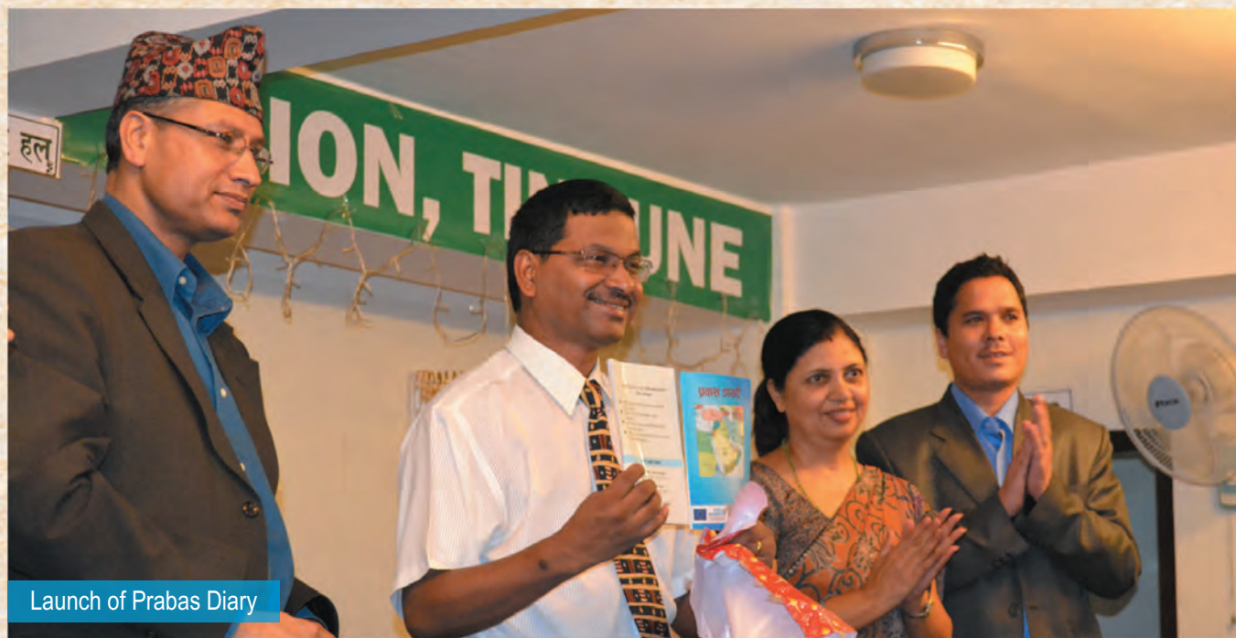
Launch of Prabas Diary