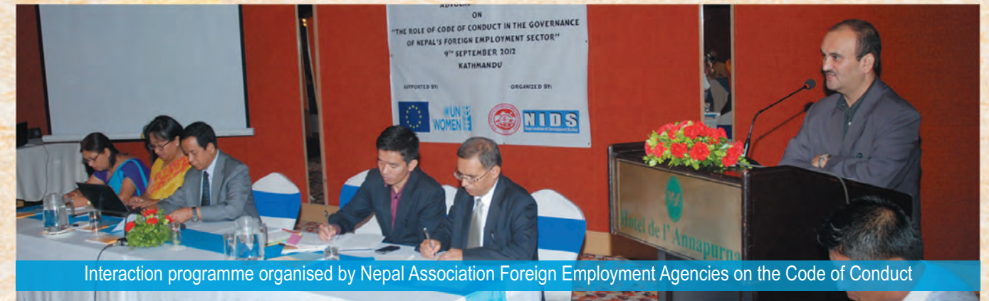
Interaction programme organised by Nepal Association Foreign Employment Agencies on the Code of Conduct

During the programme implementation, cooperation and coordination was secured from key organizations working on the issue of foreign employment such as the MOLE, the Foreign Employment Promotion Board (FEPB), local governance bodies, National Network for Safe Migration, Nepal Association of Foreign Employment Agencies, Nepal Foreign Employment Orientation Agencies Federation, Pourakhi Nepal, People's Forum, Nepal Institute of Development Studies, Association of Non Resident Nepalese Nationals, local stakeholders and the media.