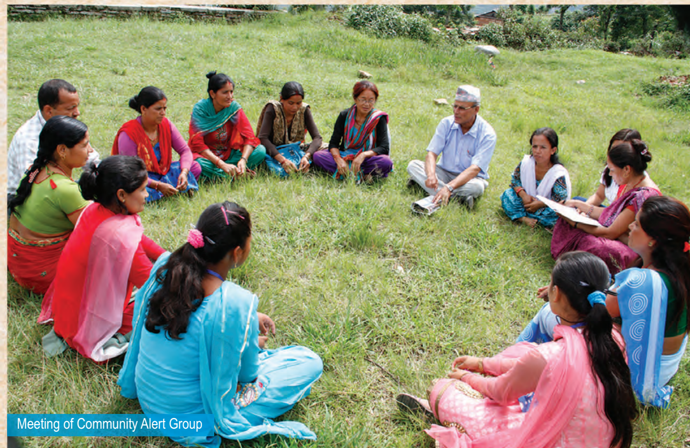
Meeting of Community Alert Group

benefiting not only the workers seeking foreign employment but their families as well. They not only also provide support to the distressed migrants and their families and provide referral support to the concerned agencies for those deceived but also facilitate the rescue of stranded migrants by liaising with the concerned offices and supporting to claim compensations and seek legal redress.