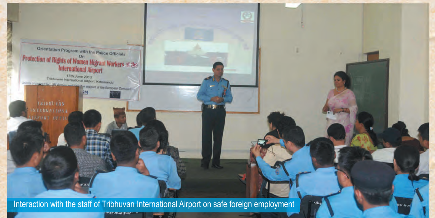
Interaction with the staff of Tribhuvan International Airport on safe foreign employment