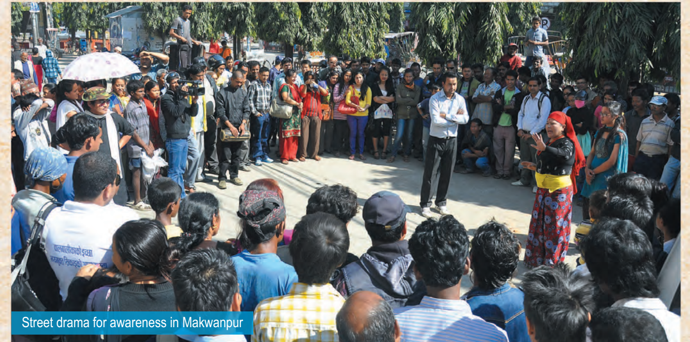
Street drama for awareness in Makwanpur