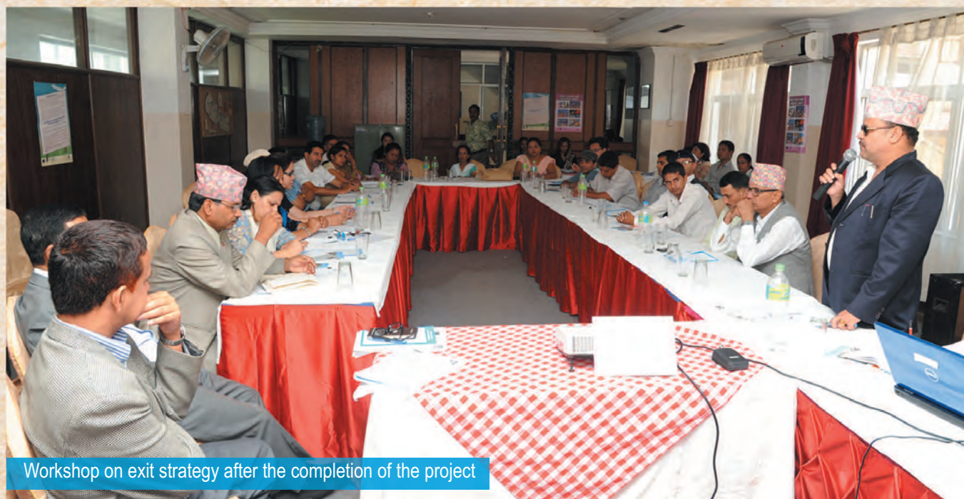
Workshop on exit strategy after the completion of the project