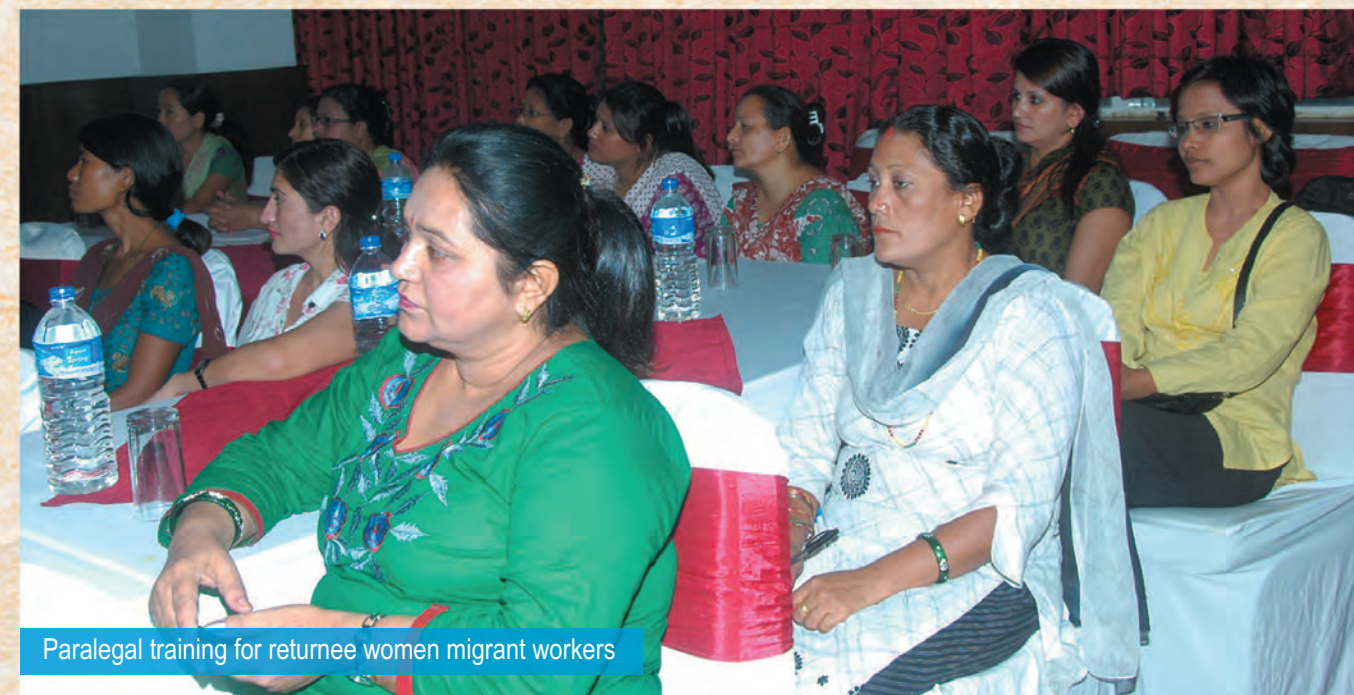
Paralegal training for returnee women migrant workers