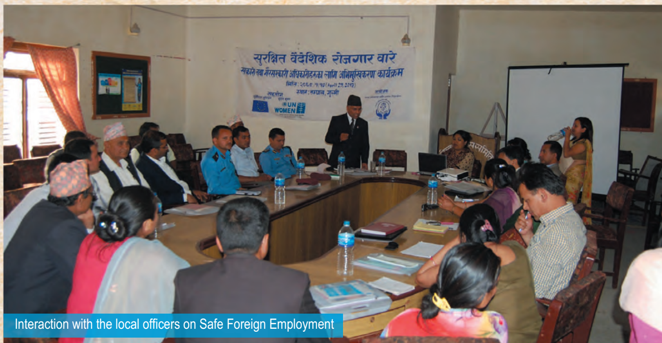
Interaction with the local officers on Safe Foreign Employment