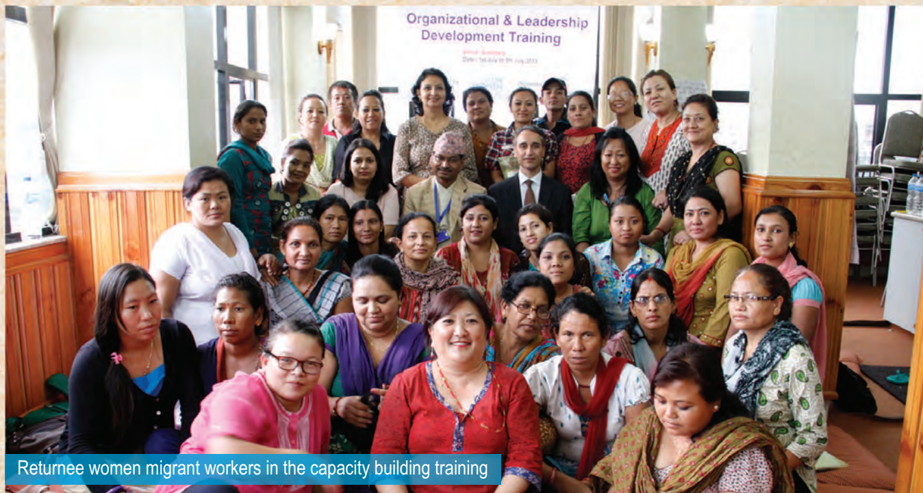
Returnee women migrant workers in the capacity building training

NRN has been helping and supporting the migrant workers and this was one of the ways to institutionalize those efforts. In 2005, UN Women had also helped to draft Code of Conduct (CoC) for one of the most important private stakeholders of foreign employment sector- the Nepal Association of Federation of Employment Agencies (NAFEA). This programme has helped to develop the implementation strategy of the CoC to enhance NAFEA's commitment to implement the CoC. It is good to note that the Department of Foreign Employment provides mandatory orientation on the CoC to recruitment agencies during the renewal of their licenses in an effort to reinforce the implementation of the CoC. The programme has also facilitated an assessment of good recruitment practice in Nepal and has tried to engage recruitment agencies in establishing such policies and mechanisms to enhance the protection of the rights women migrant workers.