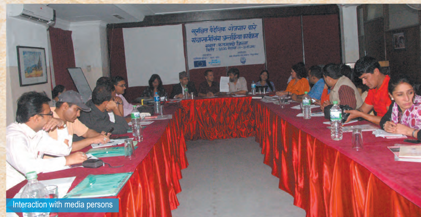
Interaction with media persons