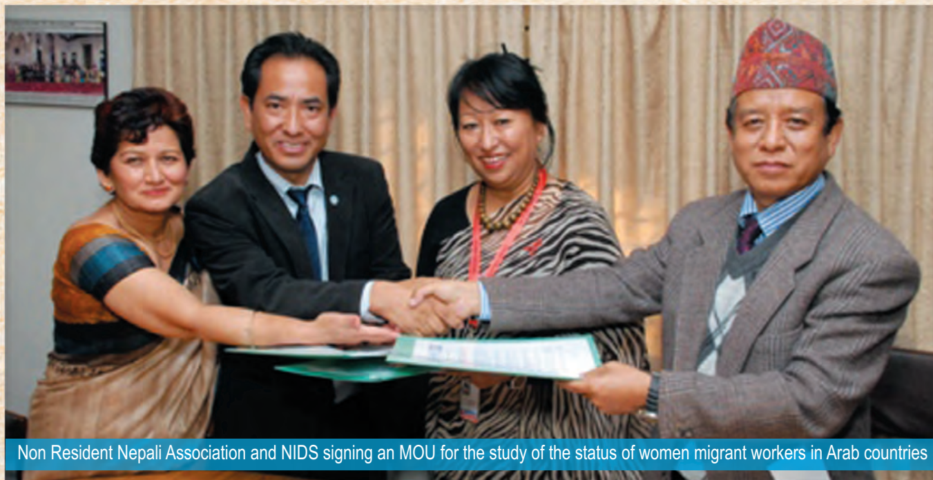
Non Resident Nepali Association and NIDS signing an MOU for the study of the status of women migrant workers in Arab countries