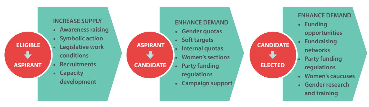
Figure 3: International Best Practices for Promoting Women's Political Participation

The target of 30% female representation, identified as a goal in the Beijing Platform for Action, has now been achieved by more than 40 countries – up from only five states in 1995. By early 2015, moreover, 11 countries had elected more than 40% women parliamentarians, including three that elected 50% or more. The most successful cases reveal concerted efforts by governments, political parties, civil society organizations, and – in some cases – international partners, to devise strategies that enhance both the supply of and demand for female candidates. The basic elements already exist in the Chinese case, with the ACWF and its local offices implementing various projects over the years to enhance women's political participation, with overseas donor agencies playing a growing role over the last ten years in efforts to stimulate rural women's political participation in particular.