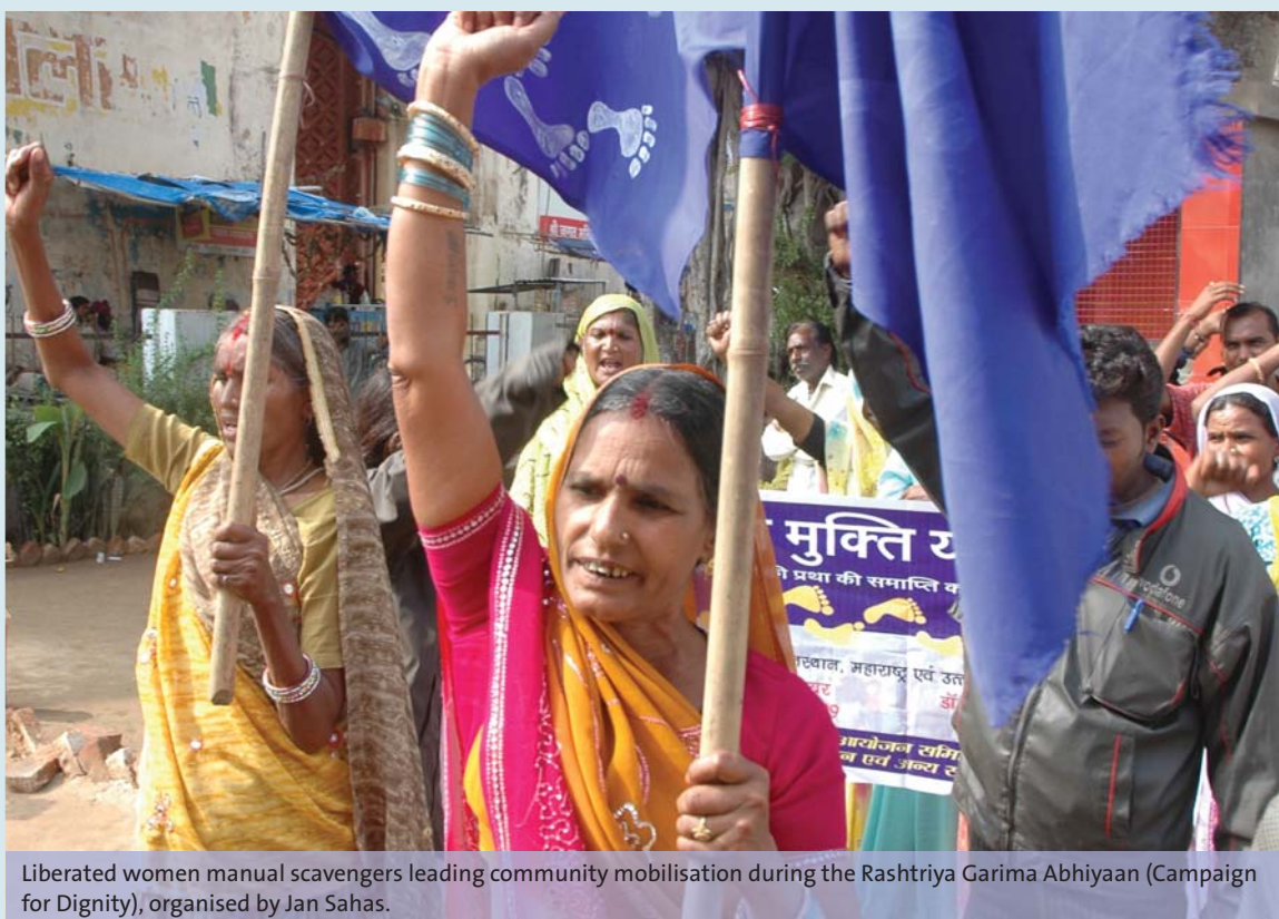
Liberated women manual scavengers leading community mobilisation during the Rashtriya Garima Abhiyaan (Campaign for Dignity), organised by Jan Sahas.

When Jan Sahas initially began working with manual scavengers, it was the initial 26 women 61 who decided to leave manual scavenging in Bhourasa nagar panchayat, Sonkatch block, Dewas District who went on to spearhead the movement, in order to ensure that others like them would not continue to endure this suffering. By sharing their personal lived experiences, these liberated women have been able to instill confidence and exhort scores of other women to abandon this practice and reclaim their dignity and self-worth. Many of the women proudly narrated how their mobility had increased manifold, having gone multiple times as part of the campaign to Delhi and Bhopal and different parts of the country, with one women saying she had even spoken at the World Social Forum.