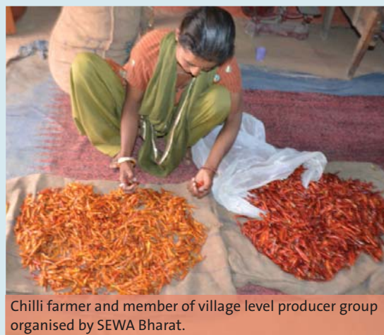
Chilli farmer and member of village level producer group organised by SEWA Bharat.

Since 2006, SEWA Bharat has been working towards organizing women in Uttarakhand, and facilitating their economic empowerment. In particular, building on the ongoing tradition of chilli farming undertaken in three blocks of Sult, Tadikhet and Bhikyasen in Almora district, SEWA Bharat has been engaging in mobilizing and organizing women chilli farmers into approximately 100 village level producer groups comprising a total of 950 members, spanning roughly 76 villages. Women chilli farmers comprising producer groups continue to function as individual farmers, cultivating chilli on their own land and receiving individual payment for the quantum of chilli grown by them. The producer group helps in facilitating savings and inter-lending. Producer groups have further recently been federated in June 2013 into a district-level producer's cooperative, named SEWA Ekta Svayattata Sahakarita (SEWA Ekta Autonomous Cooperative) under Article 3(6) of the Uttarakhand Cooperative Act of 2003. The district cooperative consists of 17 board members 49 and a current total of 95 shareholders 50 . It is envisaged that once the cooperative has considerable number of members and a sizable corpus of funds, it would develop a larger business plan to sell chilli at the district level.