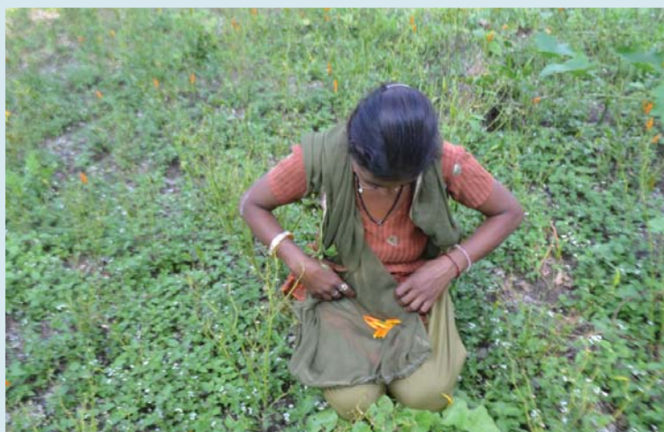
A woman farmer displaying freshly harvested chillies from her field.

SEWA Bharat pays women farmers as per the local market rates and in keeping with the quantity of produce sold. SEWA Bharat has recently started issuing payment receipts against cash payment made to women farmers when they buy their produce, and demanding receipts when they in turn sell this produce forward to