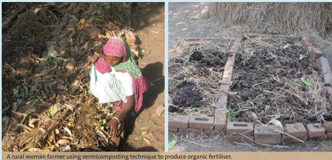
A rural woman farmer using vermicomposting technique to produce organic fertiliser.

Control over Livelihood Earnings: ANANDI has ensured that wherever possible, payment is made to women farmers for the sale of produce, and it is routed into their bank accounts. The Ratanmahaal Mandali usually pays women by cheque in case they have a bank account, or else in cash with a receipt.