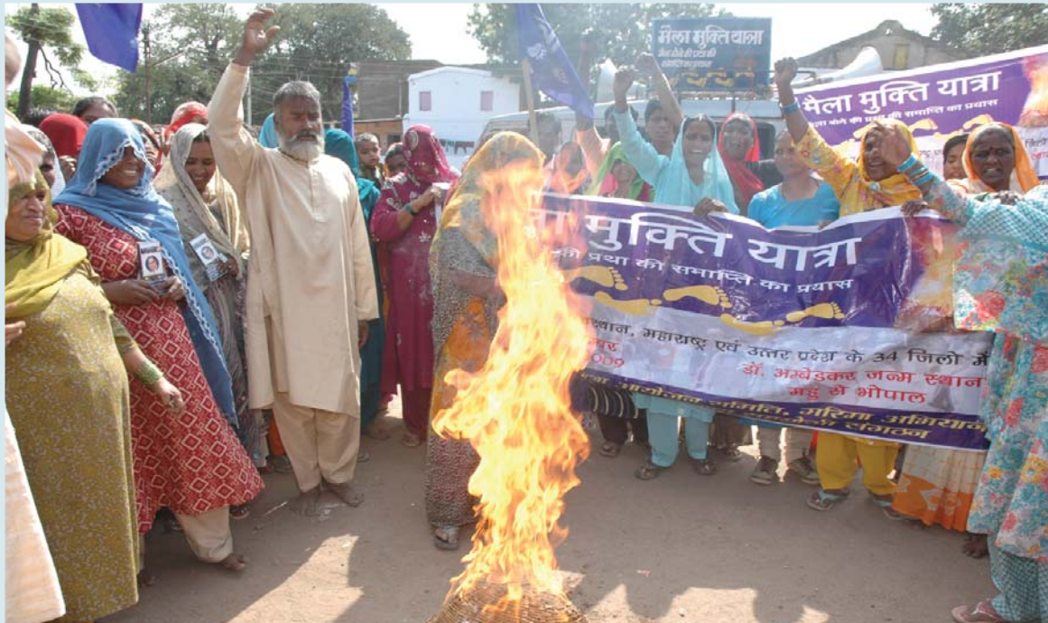
Liberated women manual scavengers burning baskets used to collect human waste during the 'Mela Mukti Yatra' (Nation wide People's March for the Eradication of Manual Scavenging).

and strategy, Jan Sahas has till date identified 34,000 manual scavengers in five states, and successfully liberated 15,000 women manual scavengers.