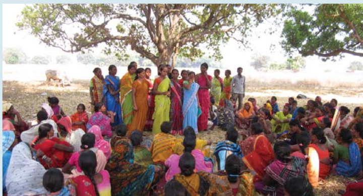
Women discuss socio-economic and political issues that affect their lives, and articulate demand for rights and entitlements to be negotiated with local stakeholders.

A key strategy adopted in the PRADAN-JAGORI project to ensure gender mainstreaming in livelihoods 62 has been to increase women's awareness and participation in local self-governance structures, institutions and processes; enhance women's claim making abilities to demand their entitlements and enhance responsiveness of duty bearers and Panchayati Raj Institutions (PRI) representatives to issues raised by the community. Therefore, in capacity building exercises and also in the accompaniment process following trainings, PRADAN-JAGORI have