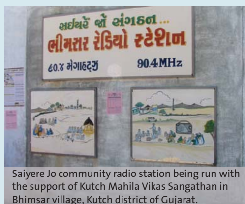
Saiyere Jo community radio station being run with the support of Kutch Mahila Vikas Sangathan in Bhimsar village, Kutch district of Gujarat.

“One of the programmes of the community radio station - Khaaso Shaasan (Good Governance) - shares good practices adopted in panchayats , depicts role-plays of difficulties faced by elected women representatives in governance and airs interviews with them highlighting their experiences in resolving local concerns... Information is also provided on dates and timings of upcoming gram sabha meetings, local events, market rates of agricultural