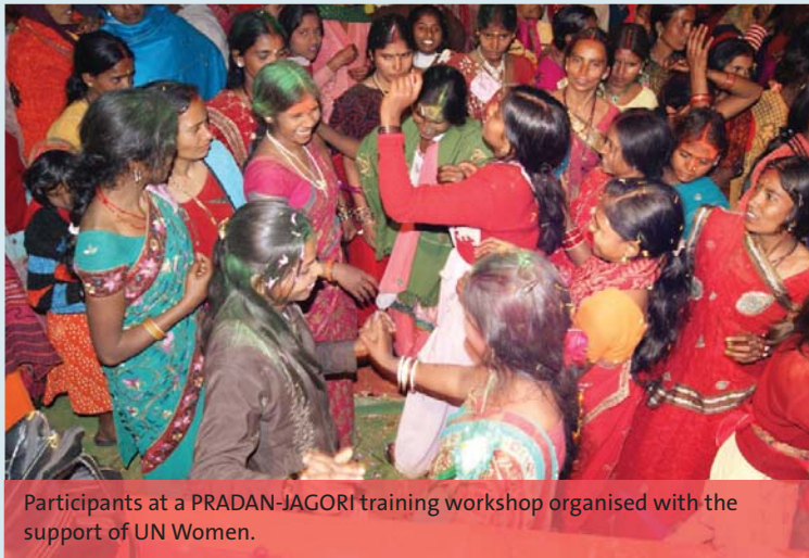
Participants at a PRADAN-JAGORI training workshop organised with the support of UN Women.

The partnership between PRADAN and Jagori has largely been successful since both organizations bring to the table their own sectoral knowledge and unique capacities. Jagori's thematic expertise of capacity development and knowledge creation on feminist concerns and principles and advocacy on women's rights and gender equality for the past 30 years, and equally PRADAN's rich experience in community-based organizing, SHG promotion and livelihoods planning has proved to be extremely complementary in the implementation of this project. As articulated in a mid-term review of this project.