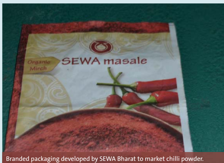
Branded packaging developed by SEWA Bharat to market chilli powder.

A major strategy that SEWA has employed for the benefit of group members is to enable processing and value addition of chilli into chilli powder, with the objective of receiving increased economic returns from this finished product. SEWA Bharat has established a processing unit - SEWA Ekta Masala Unit - in Bhatrojkhana, Bhikiyasen Block of Almora District, Uttarakhand. This processing unit comprises a