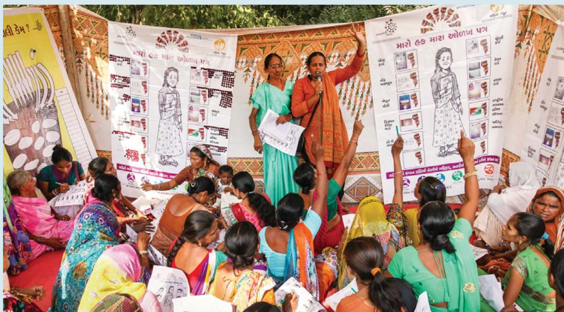
ANANDI team members conduct a training exercise on 'Mera Haq Meri Pehchaan' (My Rights and My Identity) at an Information Fair held in Bhavnagar, Gujarat on 9 th November, 2014- discussing the importance of identity proof documents that can strengthen the identity of women farmers (e.g. land title deed, Kisan Credit Card, MGNREGS job card, ration card, voter card, BPL card, RSBY card, bank passbooks, among others).

As part of the needs assessment, during local interactions with women farmers and PIAs, women articulated a common need for 81 : acknowledgement of their identity as women farmers; increased access to resources and wage work, including information and action to access and realise their social protection entitlements and social services; violence to be addressed as a public issue concerning their safety and security and legitimacy for their participation in public spaces and institutions through membership of collectives. It was realised that addressing these gender dimensions requires a long term engagement with collectives and village institutions, and also building of their capacities. Based on these learnings and feedback from the community, ANANDI developed training exercises for use by trainers in the field - Participatory Action