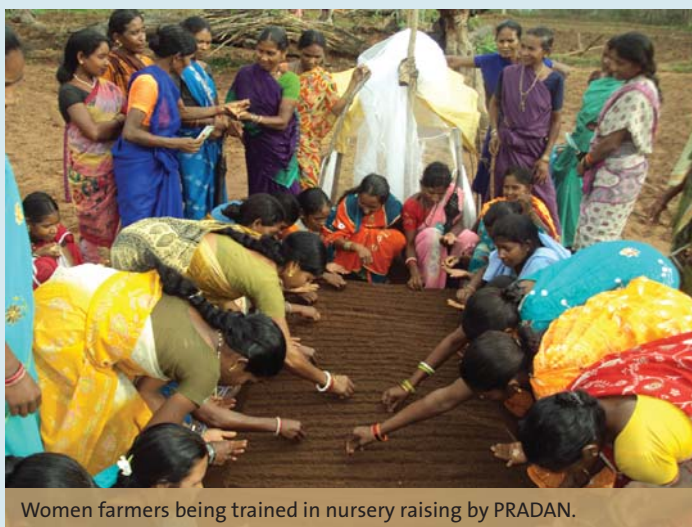
Women farmers being trained in nursery raising by PRADAN.

Additionally, PRADAN promoted SHGs have now begun to address gender discrimination in the form of dowry, witch hunting, early marriage and gender biases in education and health, besides breaking the silence around violence against women.