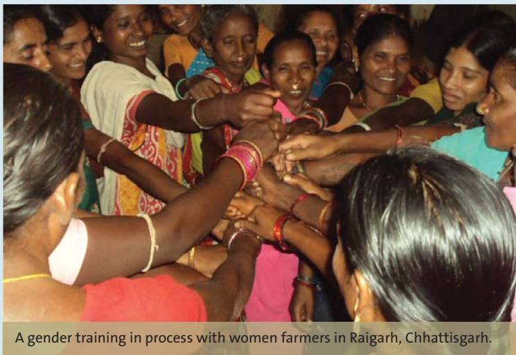
A gender training in process with women farmers in Raigarh, Chhattisgarh.

The PRADAN-JAGORI trainings also demonstrate how a wide-reaching geographic intervention covering project locations in nine districts of four states 78 necessarily requires contextual understandings and anchoring in local institutions and gender resource agencies. For instance, to support PRADAN's field team in Odisha, National Alliance of Women's Organisations (NAWO), Odisha was identified as the local gender resource partner, that would work along with the core Jagori resource team, to provide ongoing accompaniment to the process in the field.