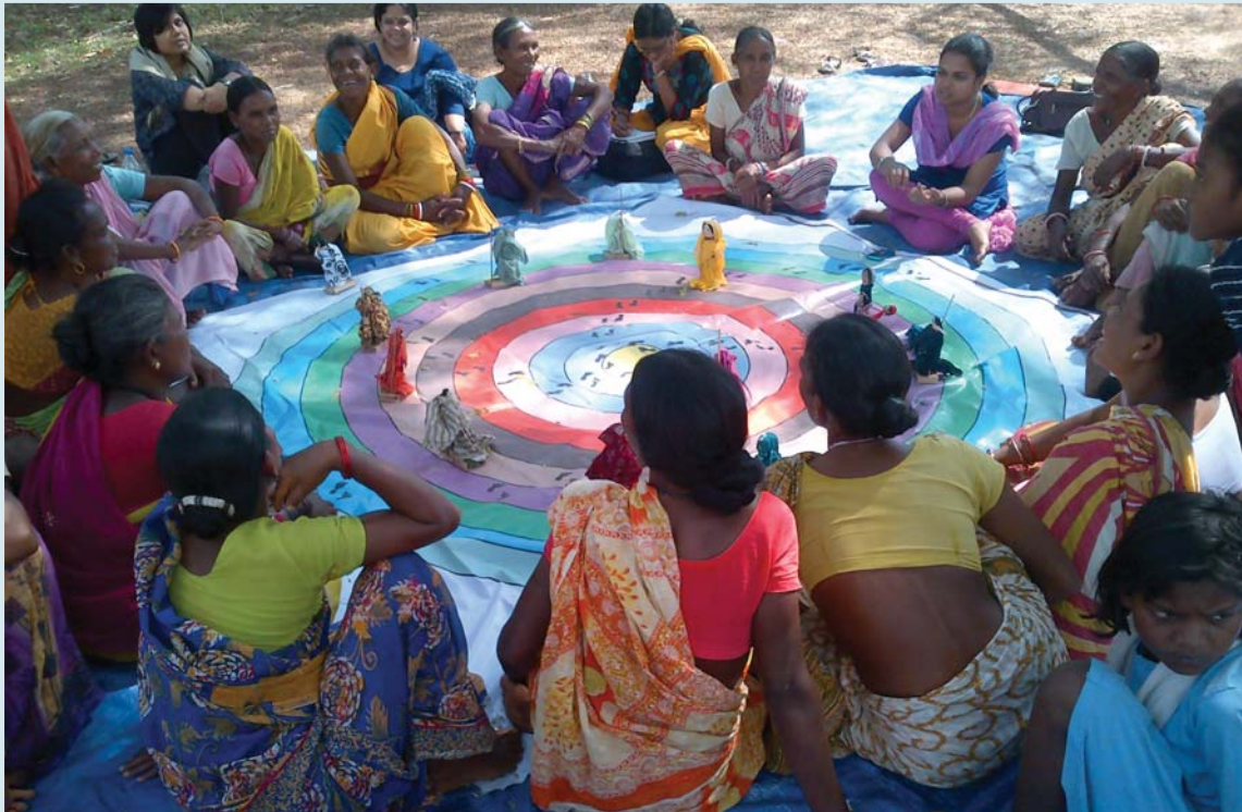
Tribal women mapping their journeys and relationships with institutions during a mid-term review of the PRADAN-Jagori project

a cadre of future women leaders and trainers, who would take ownership of the process and advance the principles of gender equality in their communities. Special attention was therefore given to train women occupying strategic positions in the community, such as community resource persons (CRPs), community service providers (CSPs) and elected women representatives, and other women government functionaries such as, among others, ASHA, aanganwadi worker, members of Gram Kalyan Samitis (village development committees) or Van Suraksha Samitis (forest protection committees). Owing to their important roles in society and their exposure and interaction with the community, these women were more likely to take up the mantle of leadership and share their learnings from capacity building exercises over a long-term. Additionally, undertaking trainings of PRADAN federation leaders has been a key strategy to ensure internal strengthening and institution building of PRADAN's leadership structures.