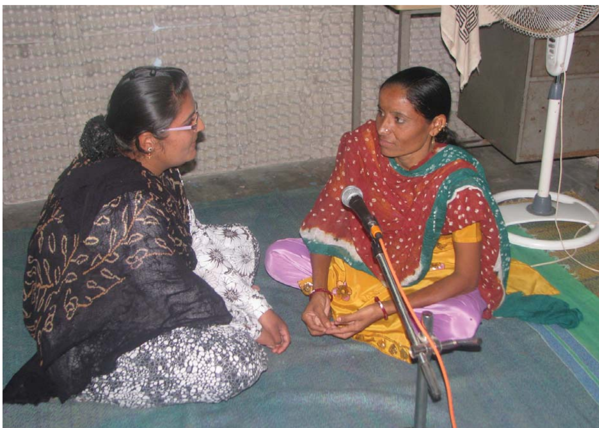
A community reporter conducting an interview at the community radio station supported by Kutch Mahila Vikas Sangathan.

In keeping with NRLM strategies for ensuring knowledge sharing through the use of ICT, mechanisms such as IVRS and Community Radio can be employed to ensure information sharing, local content generation, peer reflection and perspective building among rural women on gender and local development issues. 'ICT-enabled and women-led information centres' can also provide a space for women to dialogue and negotiate for their entitlements, interact with local functionaries and engage in horizontal networking with other community women. A major gap that was observed was the lack of dedicated physical spaces where information centres and the community radio station could be established, and special budgetary allocations could be made towards creating infrastructure such as buildings, which could serve as a base for operating these knowledge management best practices. Funds for establishing the physical infrastructure for such centres could come from NRLM's Infrastructure and Marketing Support Fund for Livelihoods. To facilitate knowledge creation, capacities of elected women representatives can be built to advocate for women's issues at local levels, and mechanisms for dialogue between elected women representatives and their constituents, as well as for increased networking among rural women, should be established. Information, IEC campaigns can also play a pivotal role in social mobilization and building awareness of the challenges faced by the most marginalised groups.