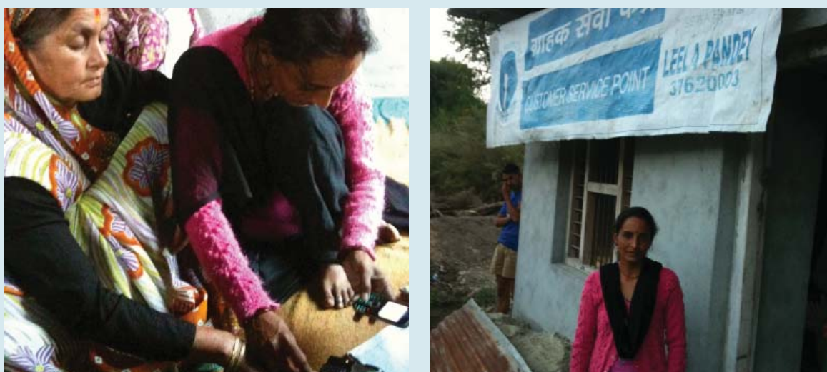
A community woman appointed as a Customer Service Point (CSP) facilitates fingerprint recognition of a customer during a financial transaction under the SEWA Bharat-SBI Business Correspondent model.

Similarly, KMVS has built the capacities of a cadre of women infomediaries and reporters at the local level. Infomediaries remain present at KMVS information centres, and assist community members in interfacing