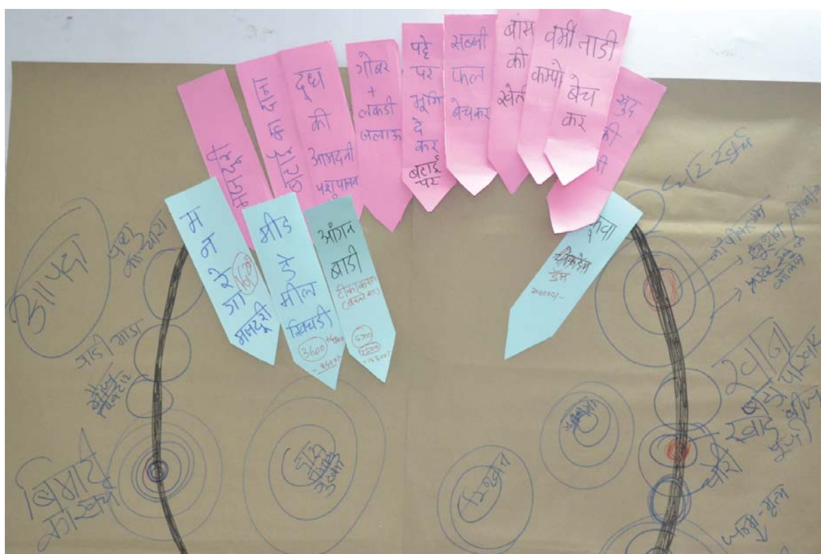
Diagrammatic presentation of the exercise 'Why is My Grain Bin Empty?', illustrating sources of household income, expenditure and the contribution of social protection entitlements, during a training session organised by the NGO ANANDI with the support of UN Women.

One of the exercises 22 undertaken by the NGO ANANDI as part of the UN Women gender equality trainings for functionaries implementing the Mahila Kisan Sashaktikaran Pariyojana (MKSP) under the NRLM framework is the exercise on “Dana Kothi Khali Kyun (Why is my grain bin empty)”. The tool demonstrates the various inputs in the household through livelihood activities (incomes), outflows in the household (expenses) and contribution of entitlements from public programmes and services towards the household poverty reduction strategy. The exercise helps illustrate the areas of spending of the household, and also reveals the potential of social protection entitlements in reducing some of these expenditures through a substitution effect, particularly, for instance in plugging the ‘holes’ in household income due to spending on healthcare and education, besides illustrating prospect of increased income to household through pensions and other income transfers.