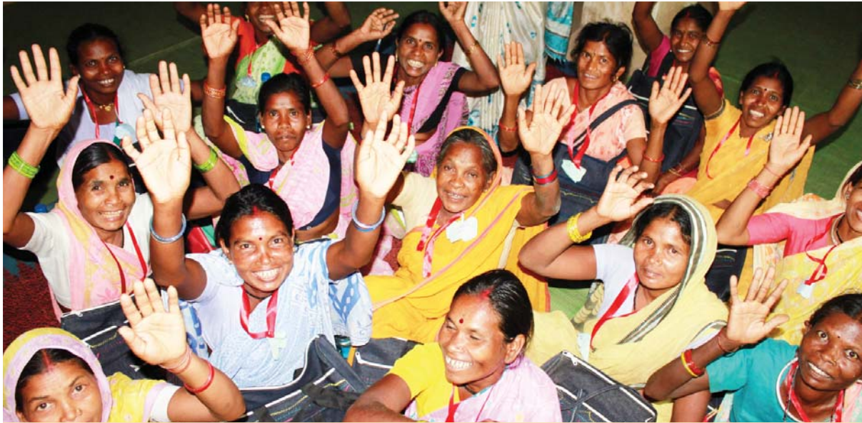
Women farmers during a leadership training camp organised with the support of UN Women.

As mentioned in an earlier section, while acknowledging that the Livelihoods vertical of NRLM focuses on interventions for skill development and self-employment as well, since the selected case studies are on sustainable agriculture and women farmers, they have been viewed against the backdrop of the Mahila Kisan Sashaktikaran Pariyojana (MKSP). The case studies of ANANDI and SEWA Bharat provide useful suggestions regarding gender-responsive strategies that could strengthen the MKSP. Both these organisations have established women's livelihood collectives in order to improve economic empowerment of women farmers, who have negligible control over land, poor control over productive assets (assets, livestock, water harvesting structures, finance), and limited access to social protection schemes. Women have been mobilised around their economic identity to form collectives that strengthen and add value to their traditional livelihood and agricultural practices for improved economic returns, besides ensuring greater access to resources, skill training, information and control over earnings by women.