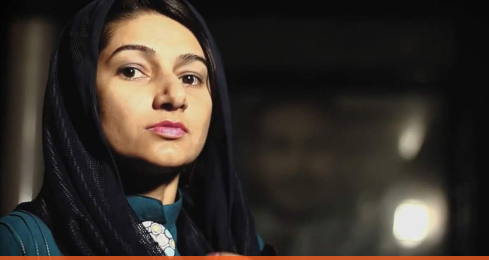
Introducing a Women's Safety Audit Tool in Pakistan to make Public Transport Safe for Women

Local studies reveal that women's movement and their use of public transport is compromised due to the discomfort, social stigma and fear of harassment when they are compelled to sit in close contact with unrelated men.