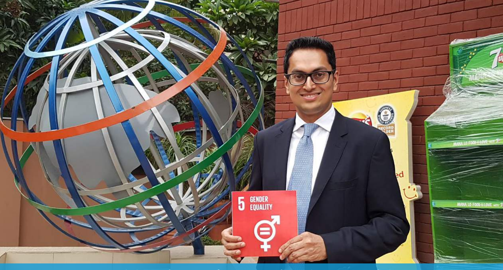
Commission on the Status of Women - Implementing Recommendations the principal intergovernmental body dedicated to promoting gender equality and women's empowerment

In implementing recommendations of the 61st Session of the Commission on the Status of Women (2017) under the priority theme "Women's Economic Empowerment in the Changing World of Work", UN Women Pakistan continues to work with and strengthen the role of the private sector and their contribution towards the economic empowerment of women.