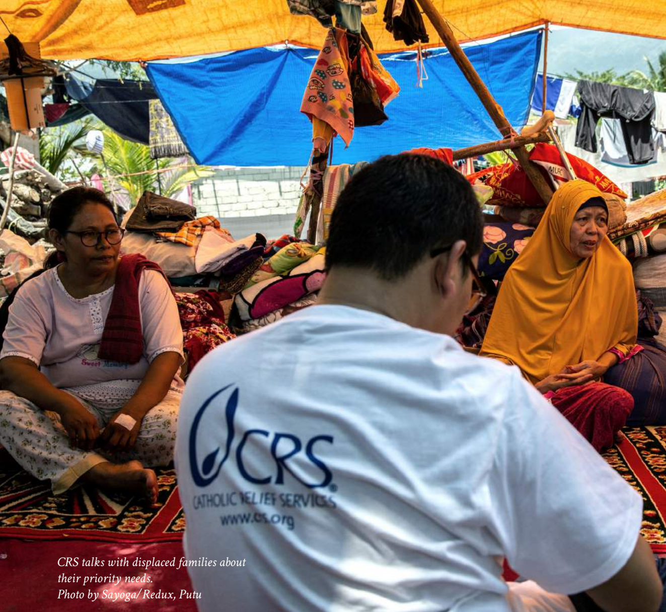
CRS talks with displaced families about their priority needs.