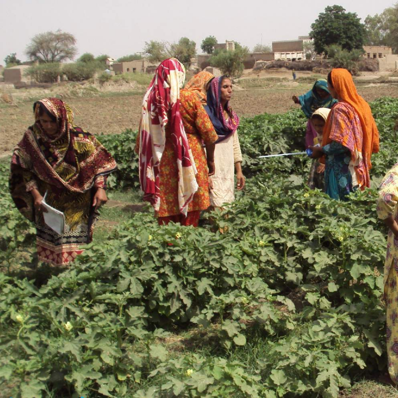
Photo: On site learning process for women beneficiaries. Credit: FAO