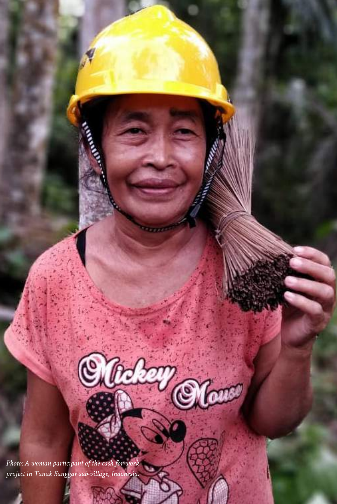
Photo: A woman participant of the cash for work project in Tanak Sanggar sub-village, Indonesia.