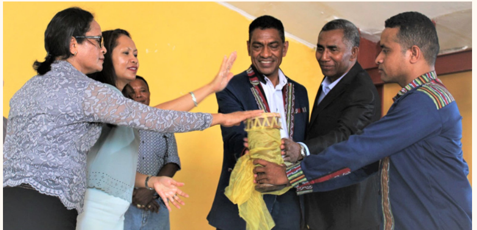
Launching of the Safe Baucau Market's taskforce.

The TWG was formed to create a safer market space for women vendors, who represent the majority of vendors in the marketplaces.