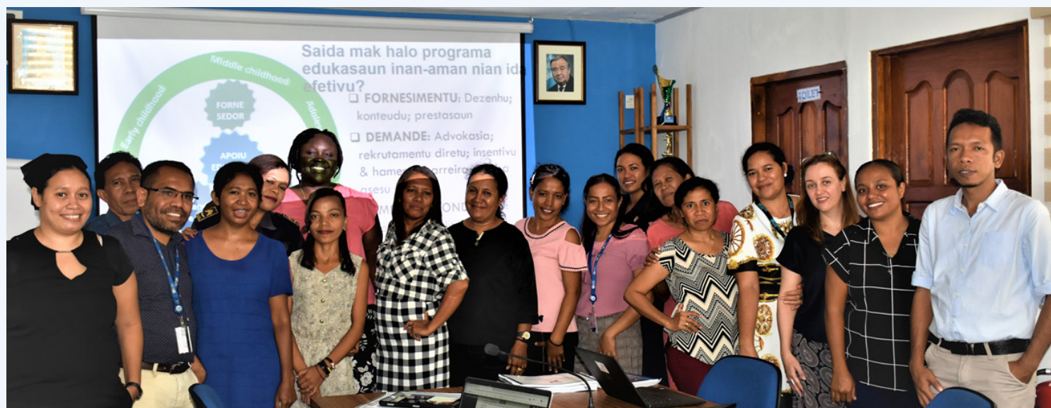
A group photo with the participants after the training.

In February 2020, UN Women convened a Prevention Collaborative, a global network of prevention practitioners, to deepen understanding of promising programmes on prevention of gender-based violence before it begins and developing parenting education that can reduce violence against women and promote gender equality. The workshops which attended by 18 participants from UN sister agencies, government institutions and Civil Society Organizations were convened with the generous support of the Governments of Australia and the Republic of Korea as part of UN Women's efforts to advance whole-school approaches to prevention. See recent briefs by the Prevention Collaborative here .