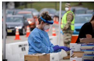
In Focus: Gender equality matters in COVID-19 response

One thing is clear about the COVID-19 pandemic, as stock markets tumble, schools and universities close, people stockpile supplies and home becomes a different and crowded space: this is not just a health issue. It is a profound shock to our societies and economies, exposing the deficiencies of public and private arrangements that currently function only if women play multiple and underpaid roles. Read more