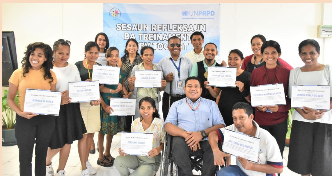
10 facilitators represent different organizations received their training certificates.

providers supporting survivors of violence to create a better service that is more accessible and inclusive for persons with disabilities, especially women and girls.