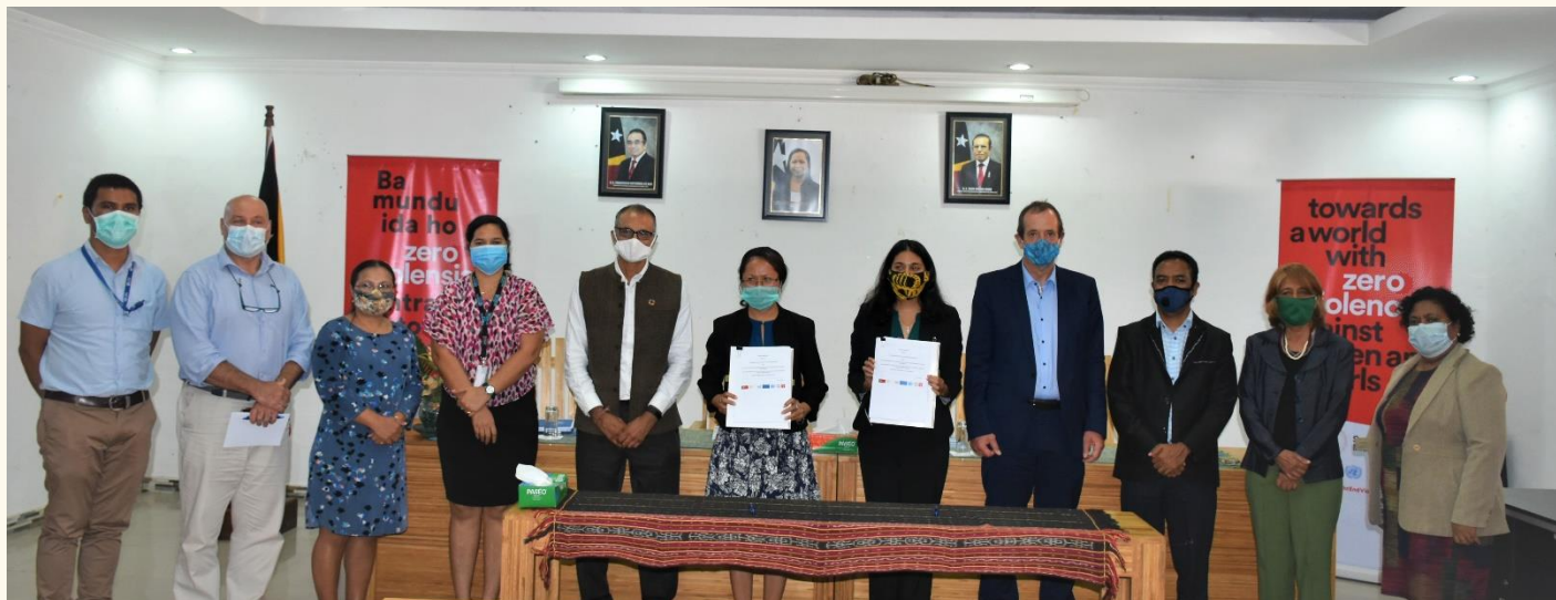
Secretary of state for equality and inclusion (SEII) signs partnership agreement with UN Women as part of the EU-UN Spotlight Initiative (SI) Program in Timor-Leste.