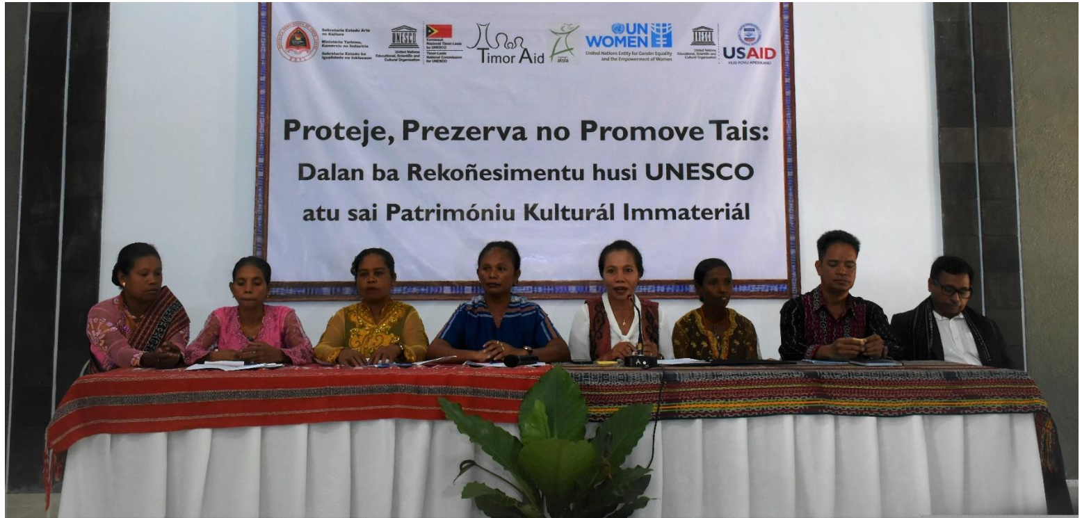
Traditional tais weavers at a panel discussion on Protect, Preserve and Promote Tais.