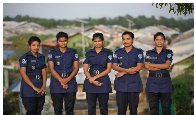
UN Women trained women police officers deployed at Women and children Help Desk at Police Station in Camp 4.

(30 Anonymous Rohingya Women from Cox’s Bazar refugee camps, October 2020.)