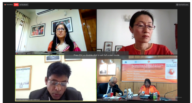
Panelists at the National Dialogue on 25th November 2020.